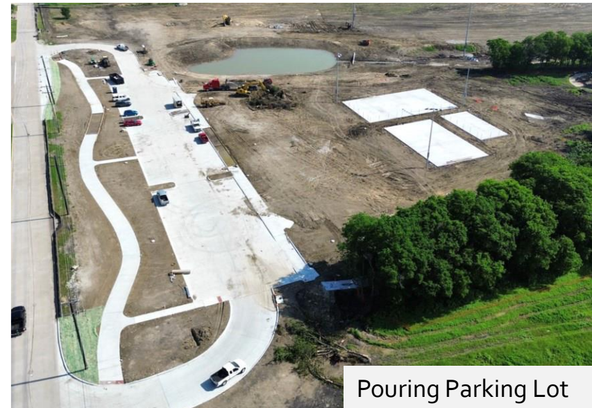
Pouring Parking Lot