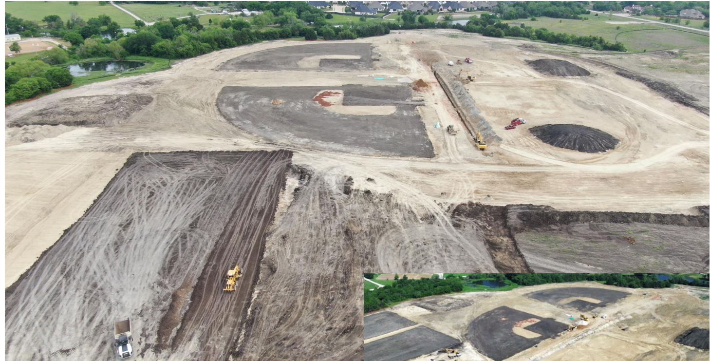
Progress – View Looking North