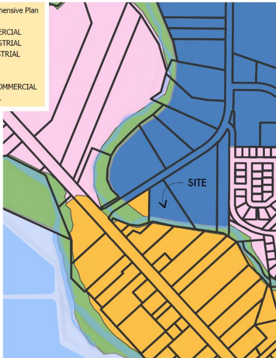
1 EXISTING DESIGNATION A4.0 SCALE: NOT TO SCALE MAP LOT 14-15-36A0-02501: HEAVY INDUSTRIAL

Prineville Comprehensive Plan AIRPORT CORE COMMERCIAL HEAVY INDUSTRIAL LIGHT INDUSTRIAL MIXED USE OPEN SPACE OUTLYING COMMERCIAL RESIDENTIAL