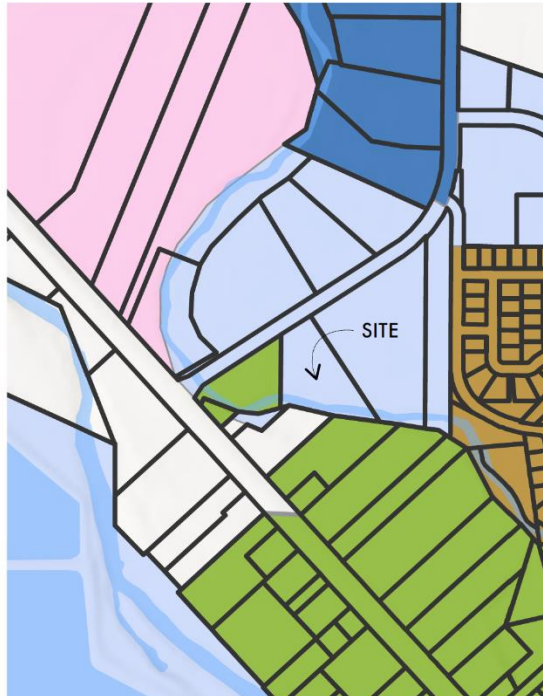
1 EXISTING ZONING A3.0 SCALE: NOT TO SCALE MAP LOT 14-15-36A0-02501: M-1 LIGHT INDUSTRIAL

AC AD AM AO C1 C2 C3 C4 C5 CMU IP M1 M2 PR R1 R2 R4