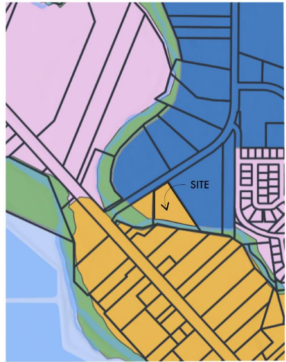
2 PROPOSED DESIGNATION A4.0 SCALE: NOT TO SCALE MAP LOT 14-15-36A0-02501: OUTLYING COMMERCIAL

Zone Designation: Light Industrial (M1) change to General Commercial (C2)