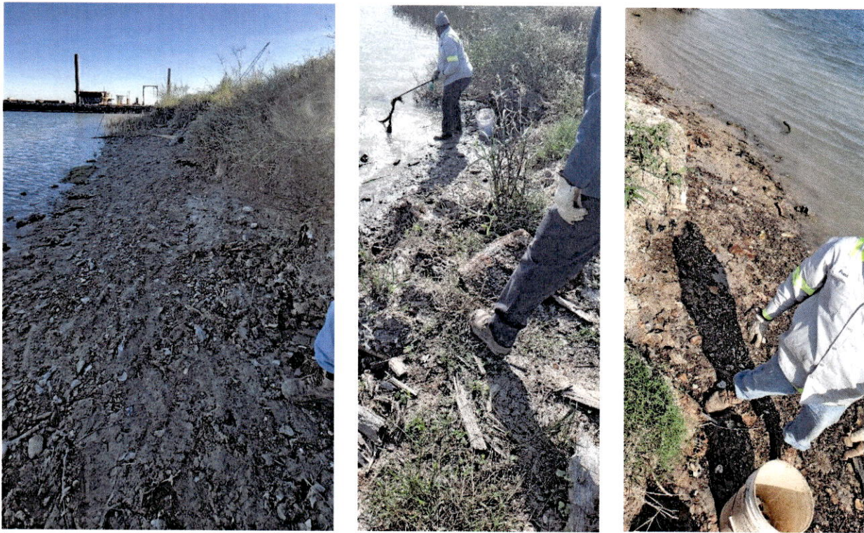
December 14, 2022 MSW 3 Area cleanup