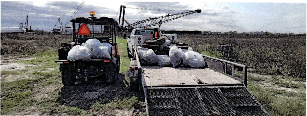
December 14, 2022 MSW 3 Area cleanup – bagged solid waste in trailers – transported to Republic Roll-off at the Public Works yard.