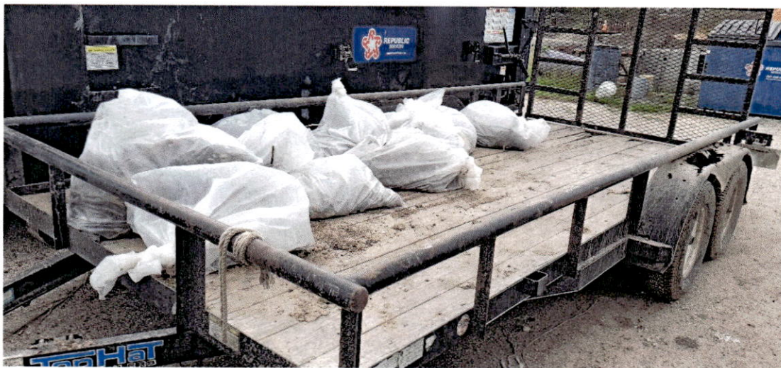
December 16, 2022 – MSW Area 3 cleanup bagged trash on trailer at roll-off at Public Works Yard