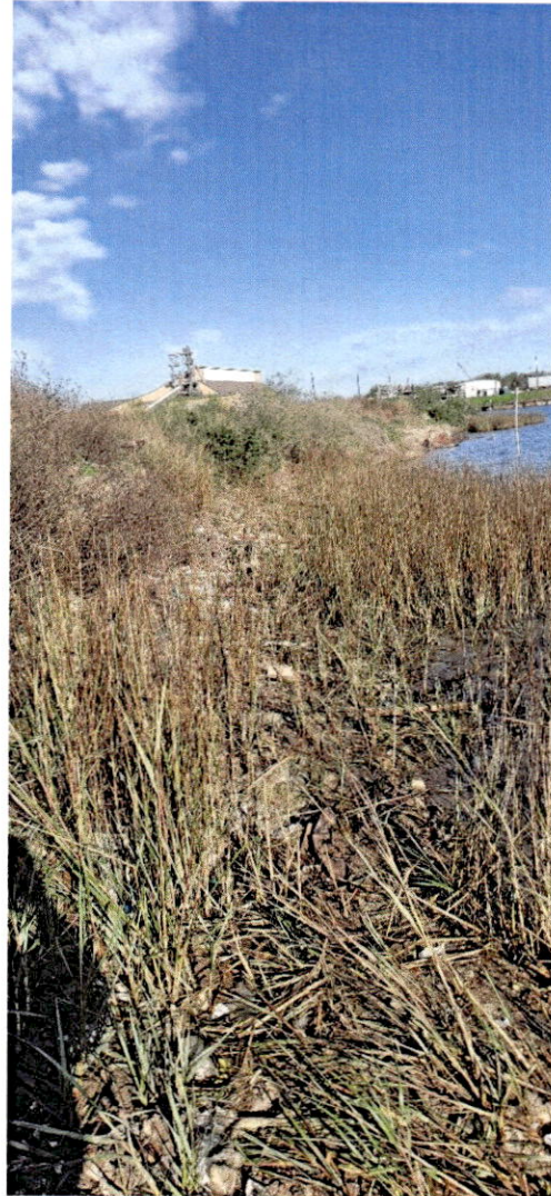
December 16, 2022 – MSW Area 3 cleanup