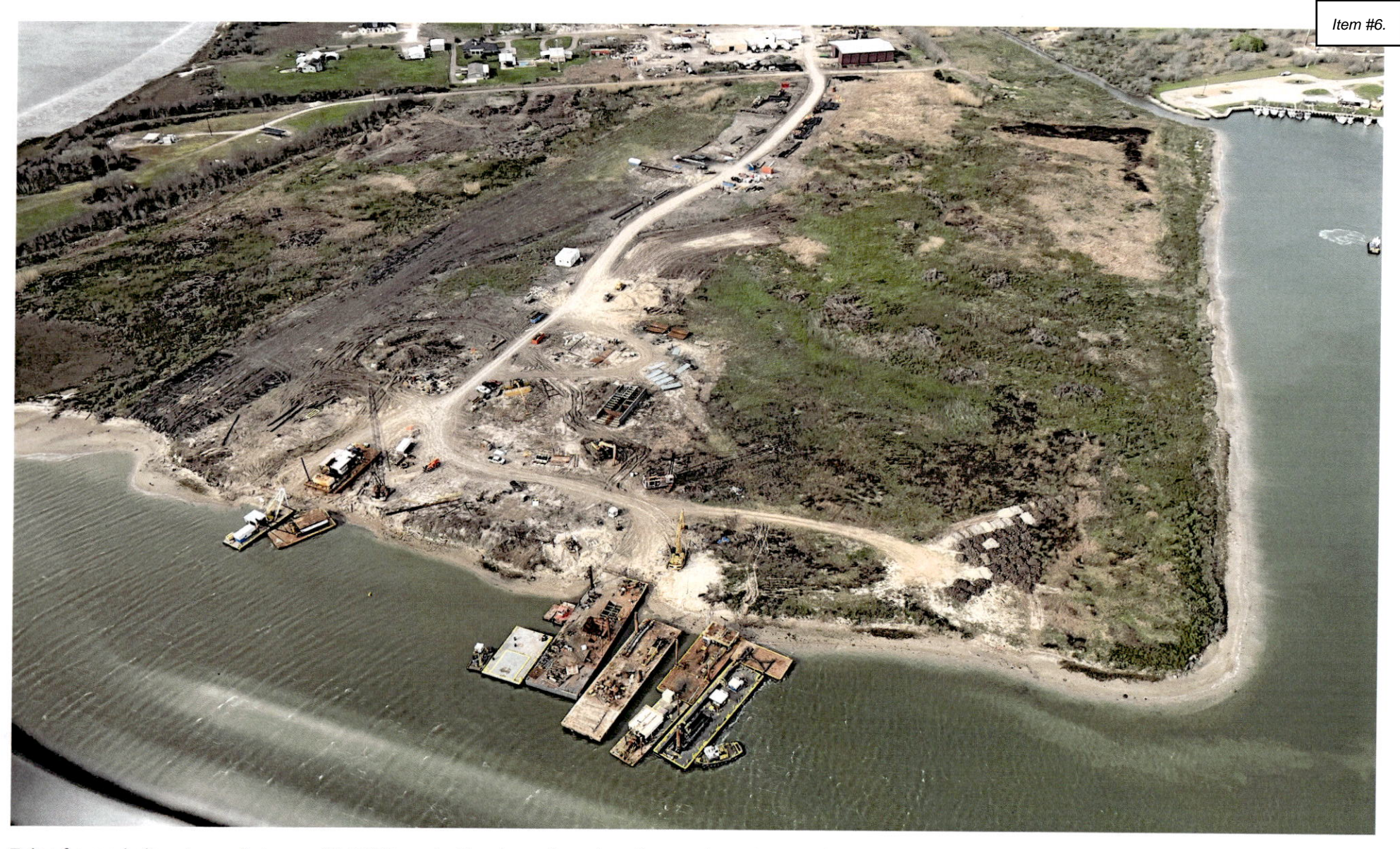
Talen from a helicopter on February 17, 2023 – note the cleaned up shoreline on the right side of the tract.