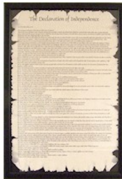
Declaration of Independence