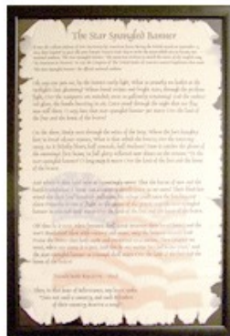
The Star Spangled Banner