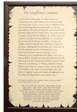
The Mayflower Compact