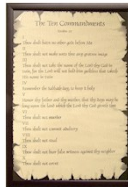
The Ten Commandments