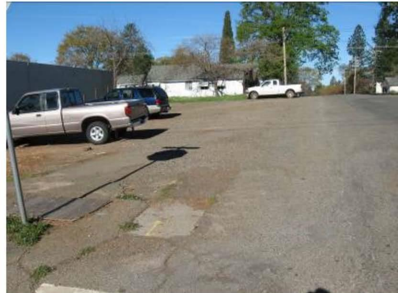
Black Olive Drive, looking south along property frontage. Notice the lack of pedestrian amenities, curb ramps, sidewalks,

This is a RDA owned property, was purchased to allow the removal of hazardous, dilapidated buildings, and to insure that future business's at that location would be appropriate for it's location (across the street from the proposed new Town Civic Center).