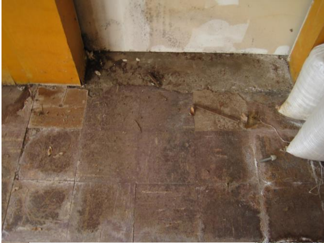
Parcel #3 5456 Black Olive Drive