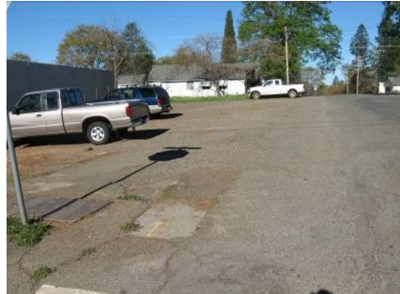
Black Olive Drive, looking south along property frontage. Notice the lack of pedestrian amenities, curb ramps, sidewalks,

This is a RDA owned property, was purchased to allow the removal of hazardous, dilapidated buildings, and to insure that future business's at that location would be appropriate for it's location (across the street from the proposed new Town Civic Center).