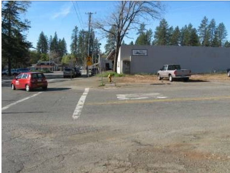
Looking west on Birch Street from Black Olive. Parcel is currently used as a “de-facto” parking lot, even though it is not