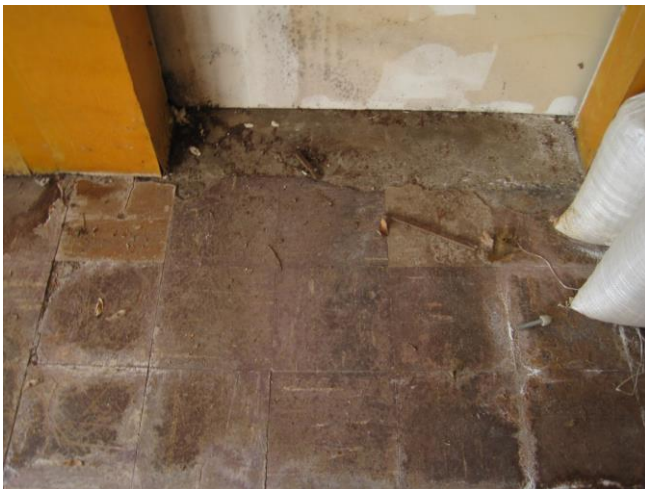
Parcel #3 5456 Black Olive Drive

The parcel remained underdeveloped until the Town improved it as a park and ride facility in 2010 and completed in 2011.