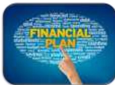
MEASURE C FINANCIAL PLAN