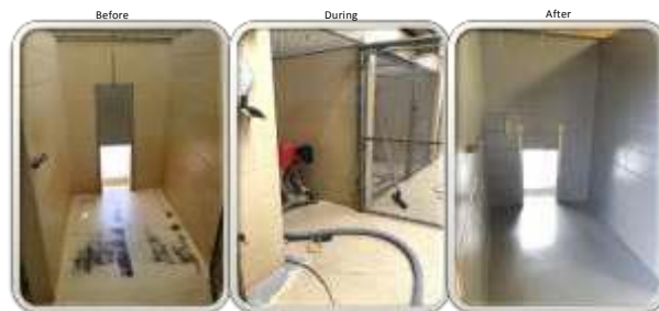
Epoxy Project - Kennel