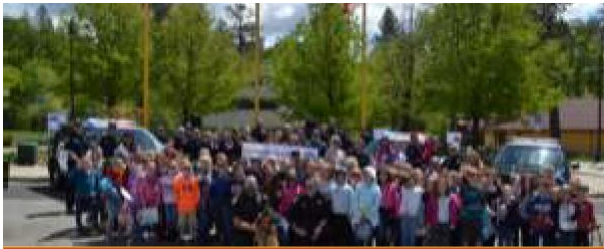
Community Outreach – Measure C Day