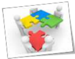
2018/19 MEASURE C PRELIMINARY BUDGET