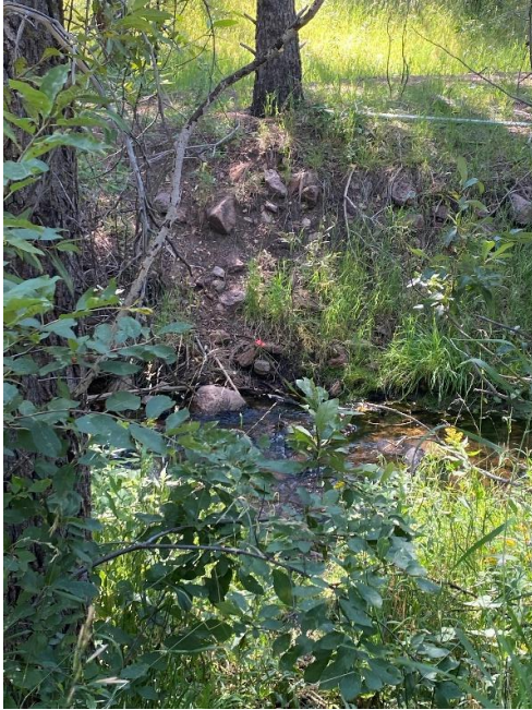
Fig. 2 Chicken Coop Bridge Site

The trail continues to meander adjacent to the creek until the hiker reaches a crossing that has heavy erosion where USAFA will construct the Chicken Coop Bridge (see fig. 2). After crossing, the trail continues to a grassy area and after the grassy area there was a historic bridge that connected the area to Epworth Highway. The USAFA will construct the Historic Epworth Bridge at this site (see fig. 3).