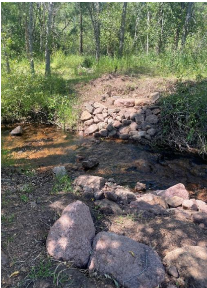
Fig. 1 Kent Street Bridge Site

This new trail connects to Santa Fe Tail located in the Palmer Lake Recreational Area. The trail crosses Colorado Highway 105 at Spring Street. The trail continues down Kent Street and the new trail construction begins at the end of the street. From the end of Kent St, the trail goes down to North Monument Creek where USAFA will construct the Kent Street Bridge (see Fig. 1).