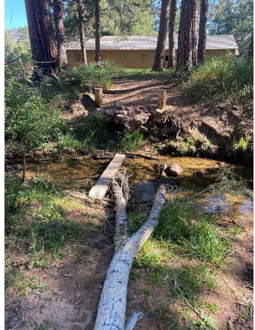
Fig. 3 Historic Epworth Bridge Site