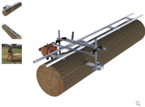
Click or Tap image to Zoom

Item# 70635 ★★★★★ 4.9 (30) Write a Review Ask a Question