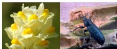
Yellow Toadflax Biocontrol