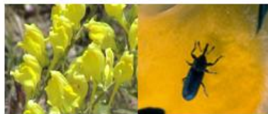
Dalmatian Toadflax Biocontrol