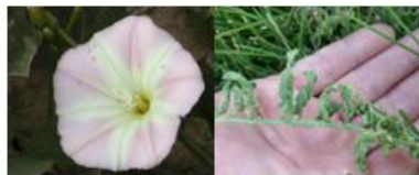
Field Bindweed Biocontrol