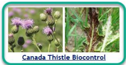
Canada Thistle Biocontrol