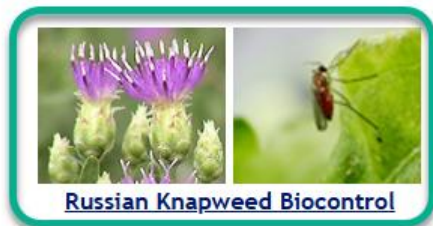
Russian Knapweed Biocontrol