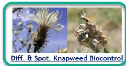
Diff. & Spot. Knapweed Biocontrol