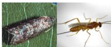
Peach Moth Biocontrol