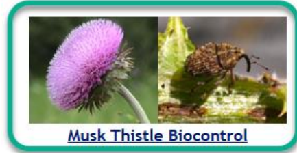
Musk Thistle Biocontrol