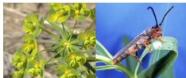
Leafy Spurge Biocontrol