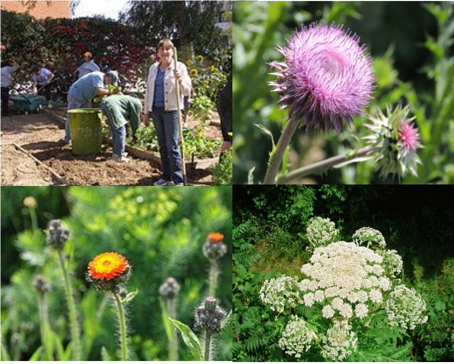
NOXIOUS WEEDS, PARKS, TRAILS