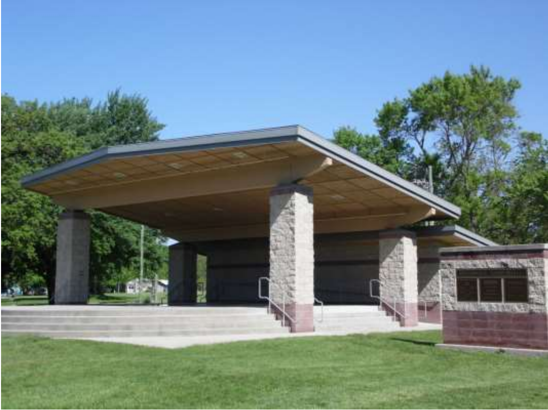
Potential new band shell