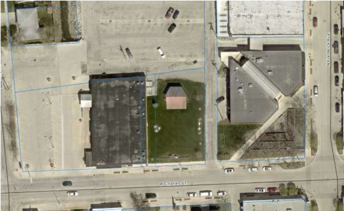
Existing Park Area