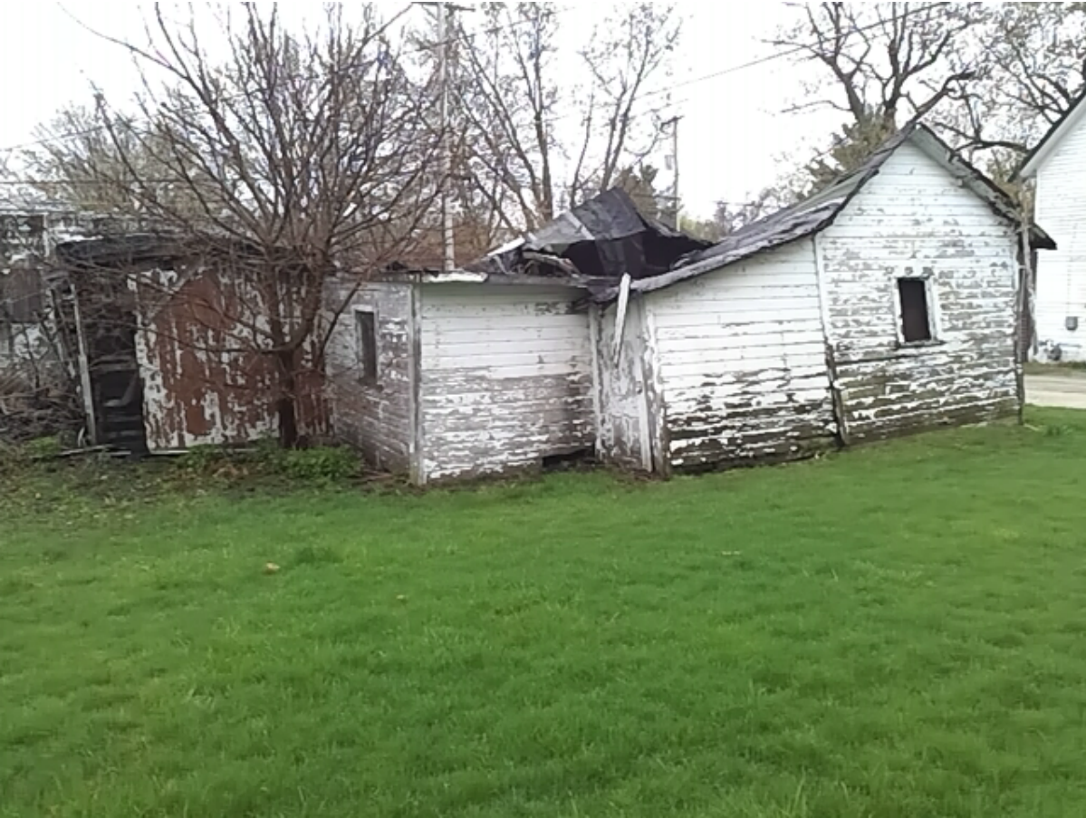
Photo: Collapsed Structure