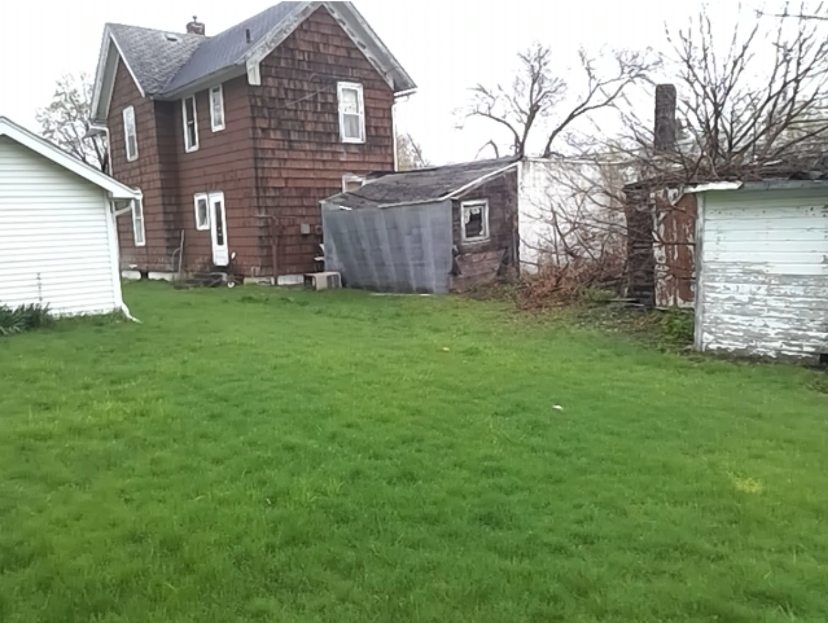
Photo: Collapsed structure

Date Taken: 04/29/2019 Address: 303 2 St