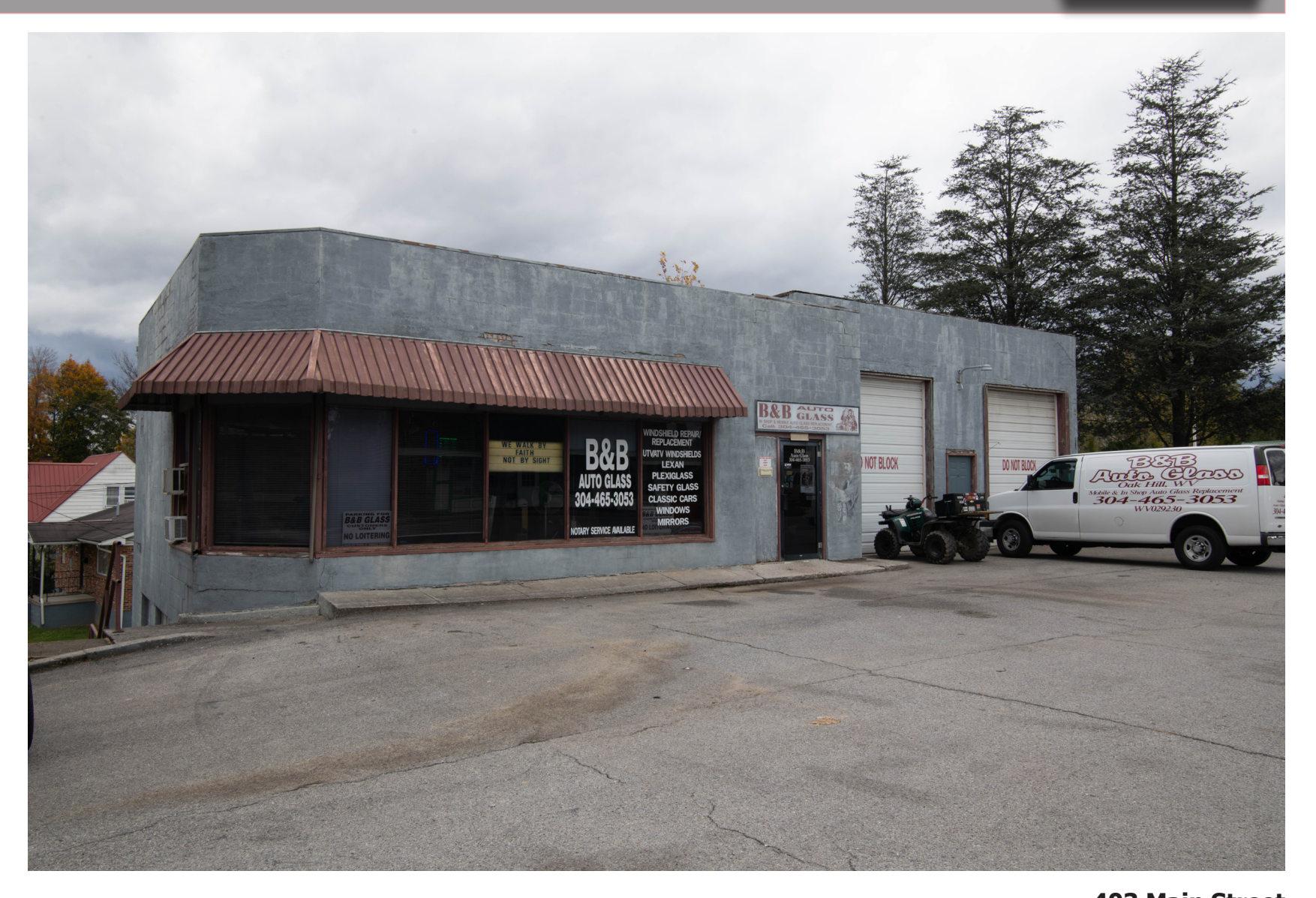
403 Main Street Building lacks interesting features. Facade needs painting. Signage is overdone.