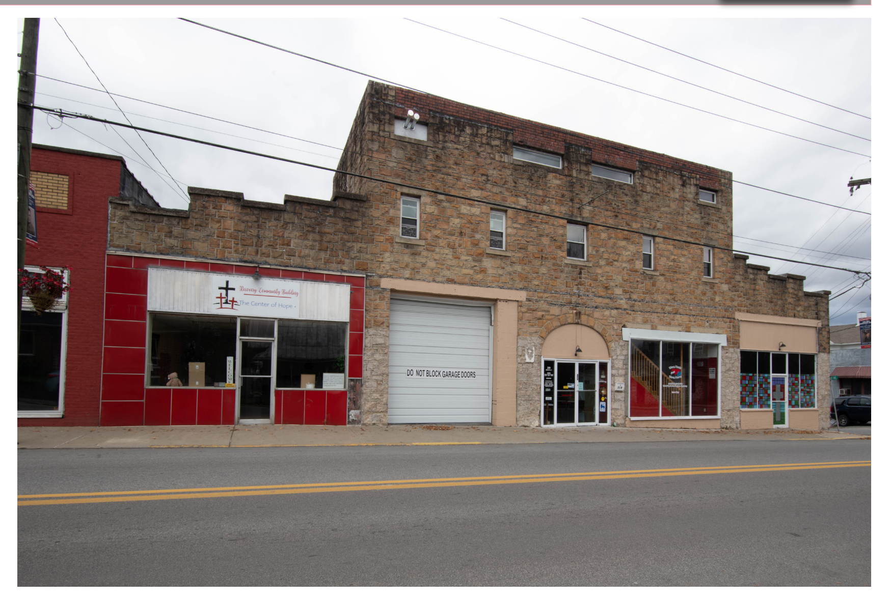
319 Main Street

Facade needs cleaning. Facade covering inappropriate. Coordinate color of features and details.