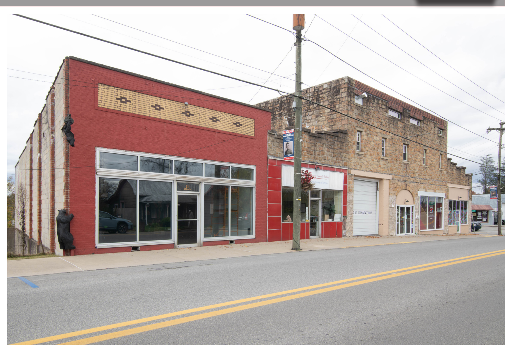
311 Main Street