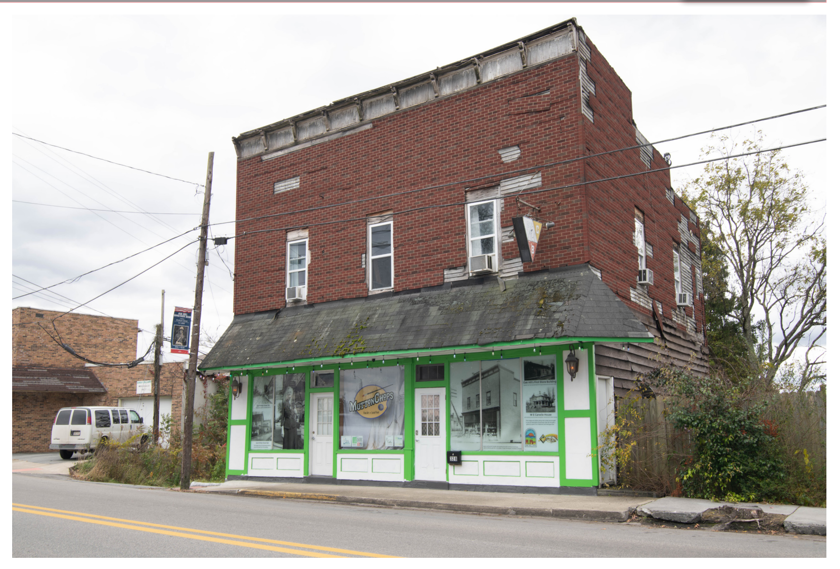
328 Main Street Remove false brick, replace canopy. Continue trim details and colors.