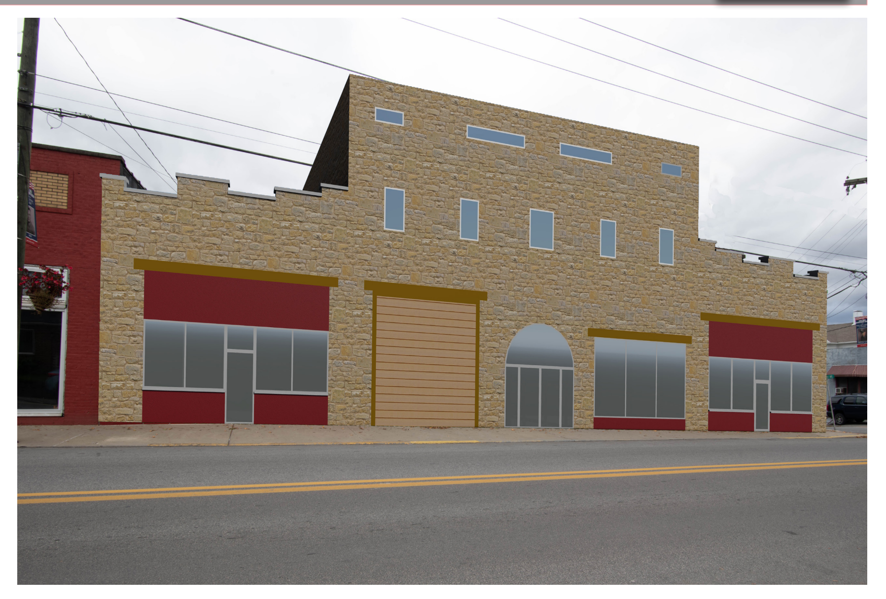
319 Main Street

Stone facade exposed, cleaned, and repaired. New glass transom over main entrance. Coordinated color of features and details.