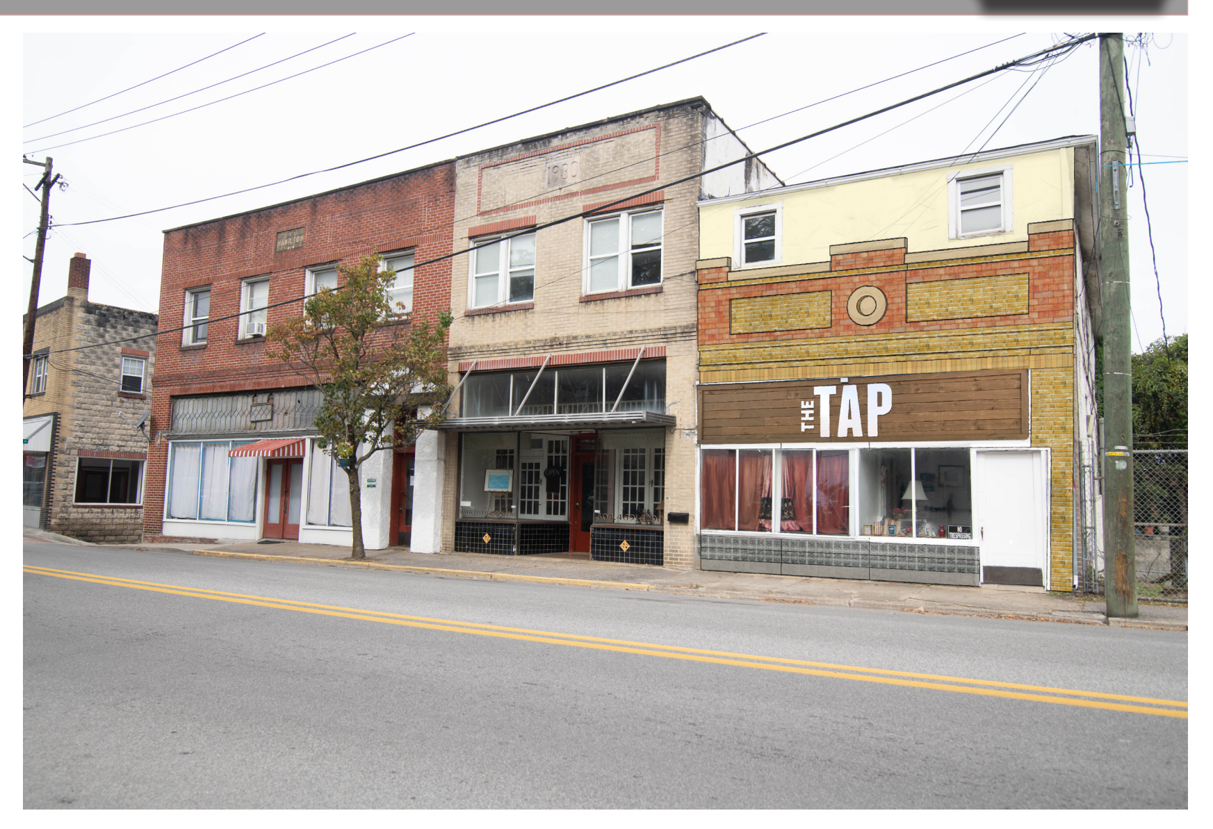
201 Main Street

Clean original brick facade and paint upper addition. New modern signage.