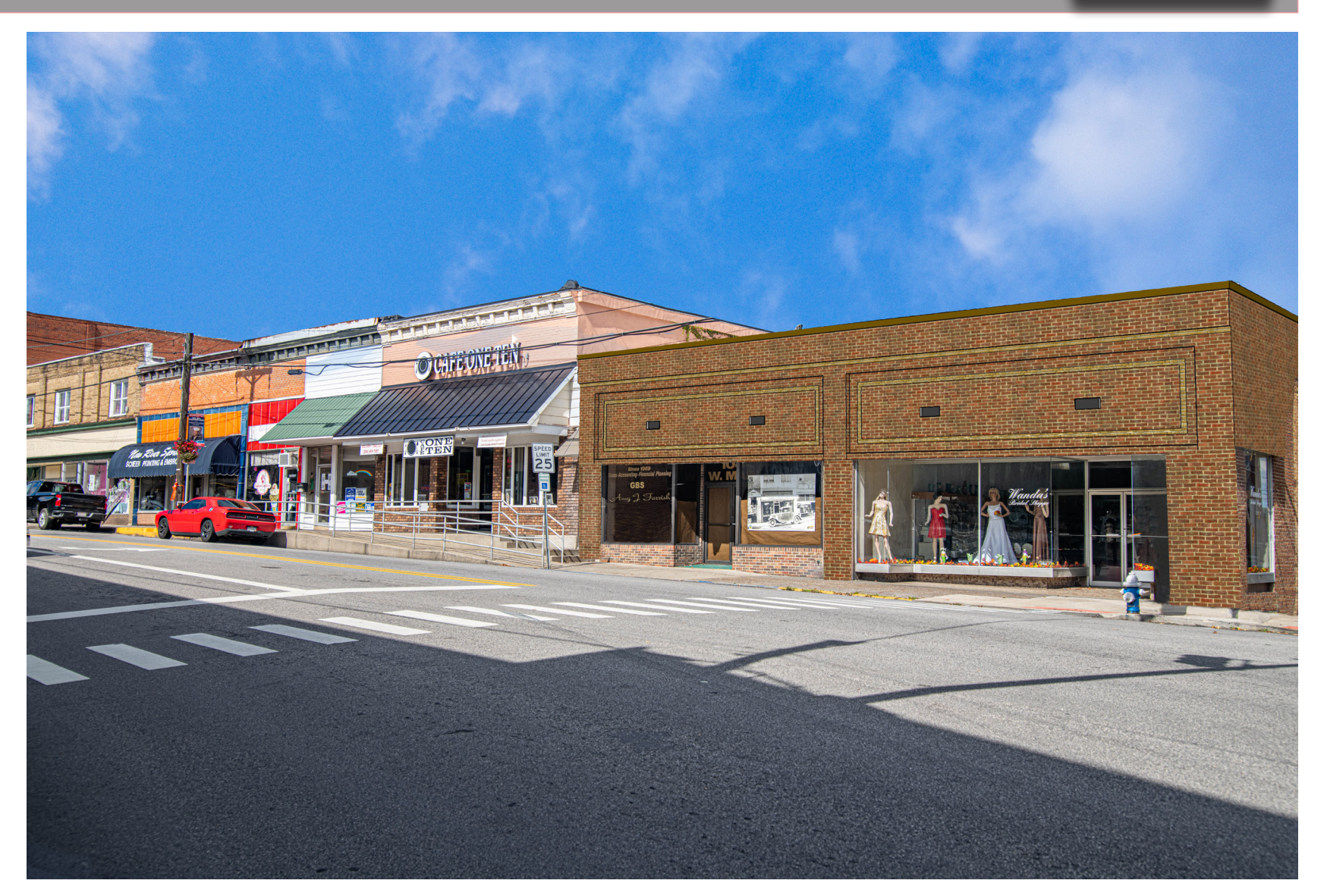
102 and 104 Main Street

Removed false facades. Expose and clean original brick facade. Replace tile/brick to match original at sidewalk level.