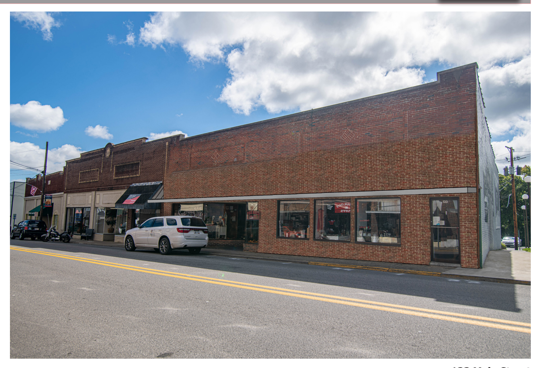
133 Main Street New low-profile canopy. Brick at sidewalk level restored.