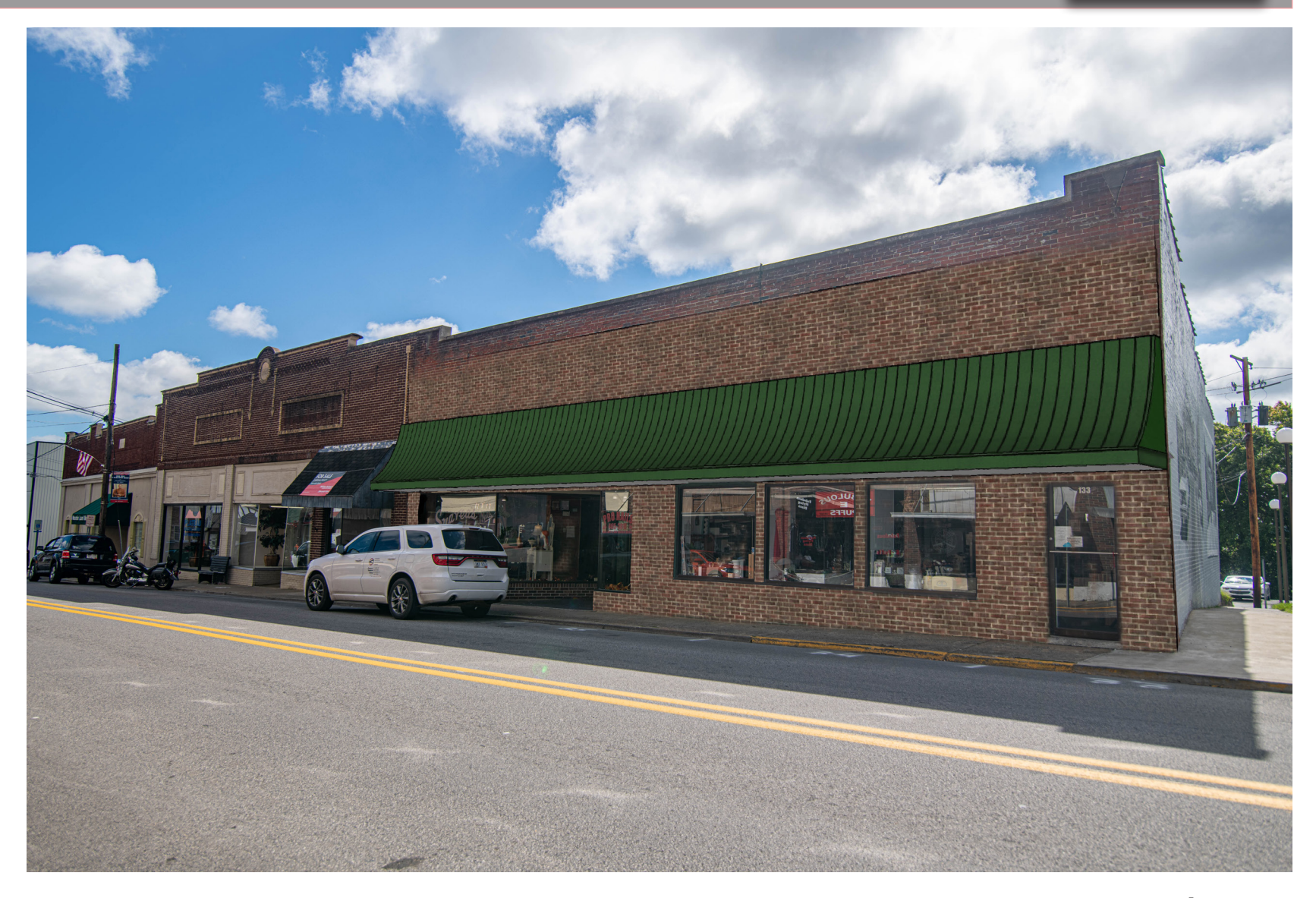
133 Main Street New fabric canopy. Brick at sidewalk level restored.