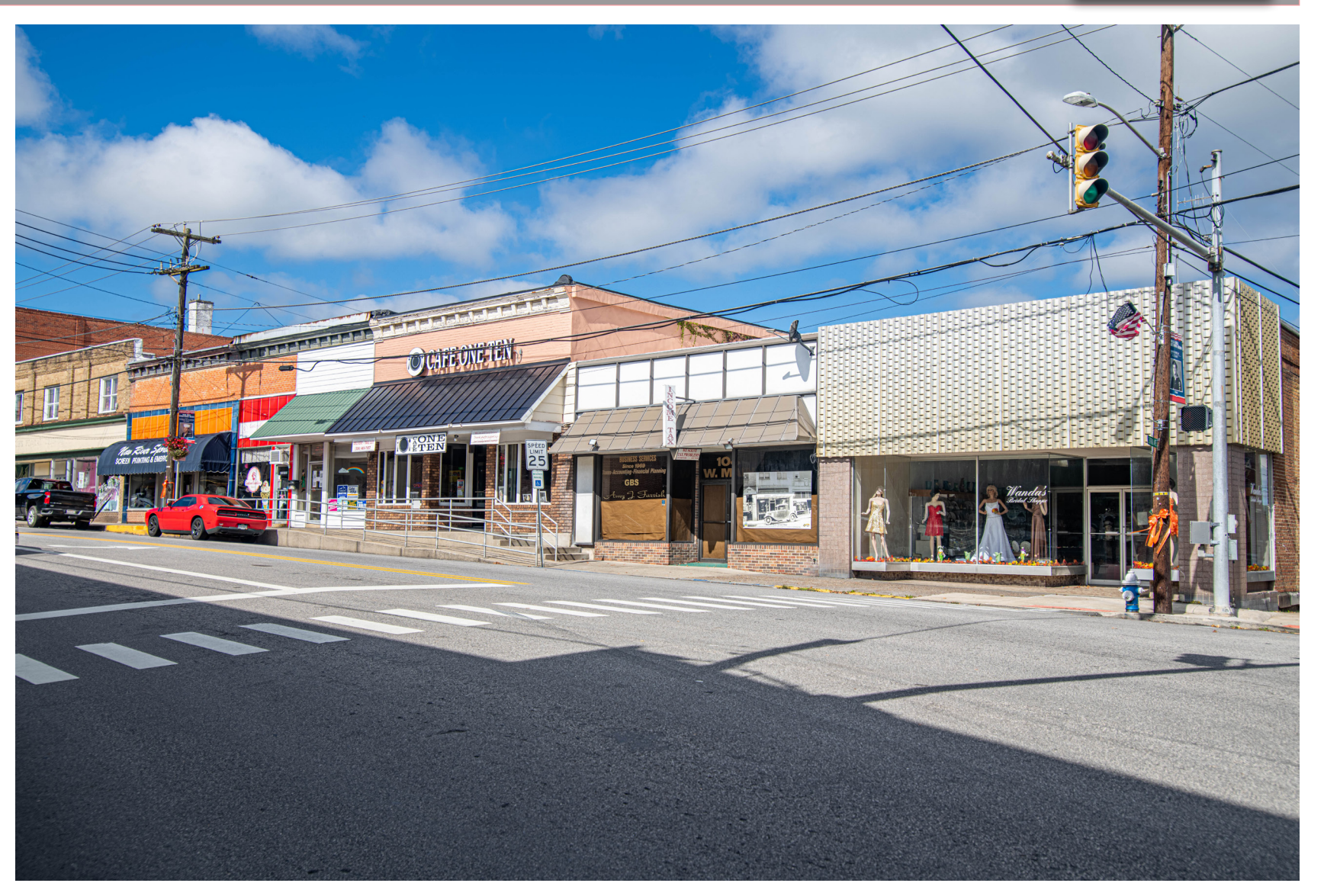
102 and 104 Main Street False facades are dated.