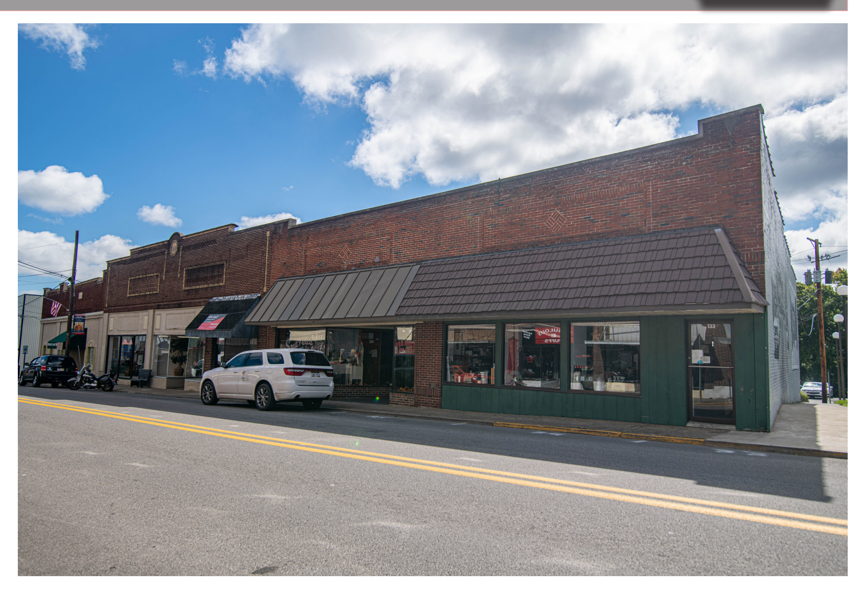
133 Main Street

Canopies feel heavy and are mismatched. Facade brick at sidewalk level is covered with siding.