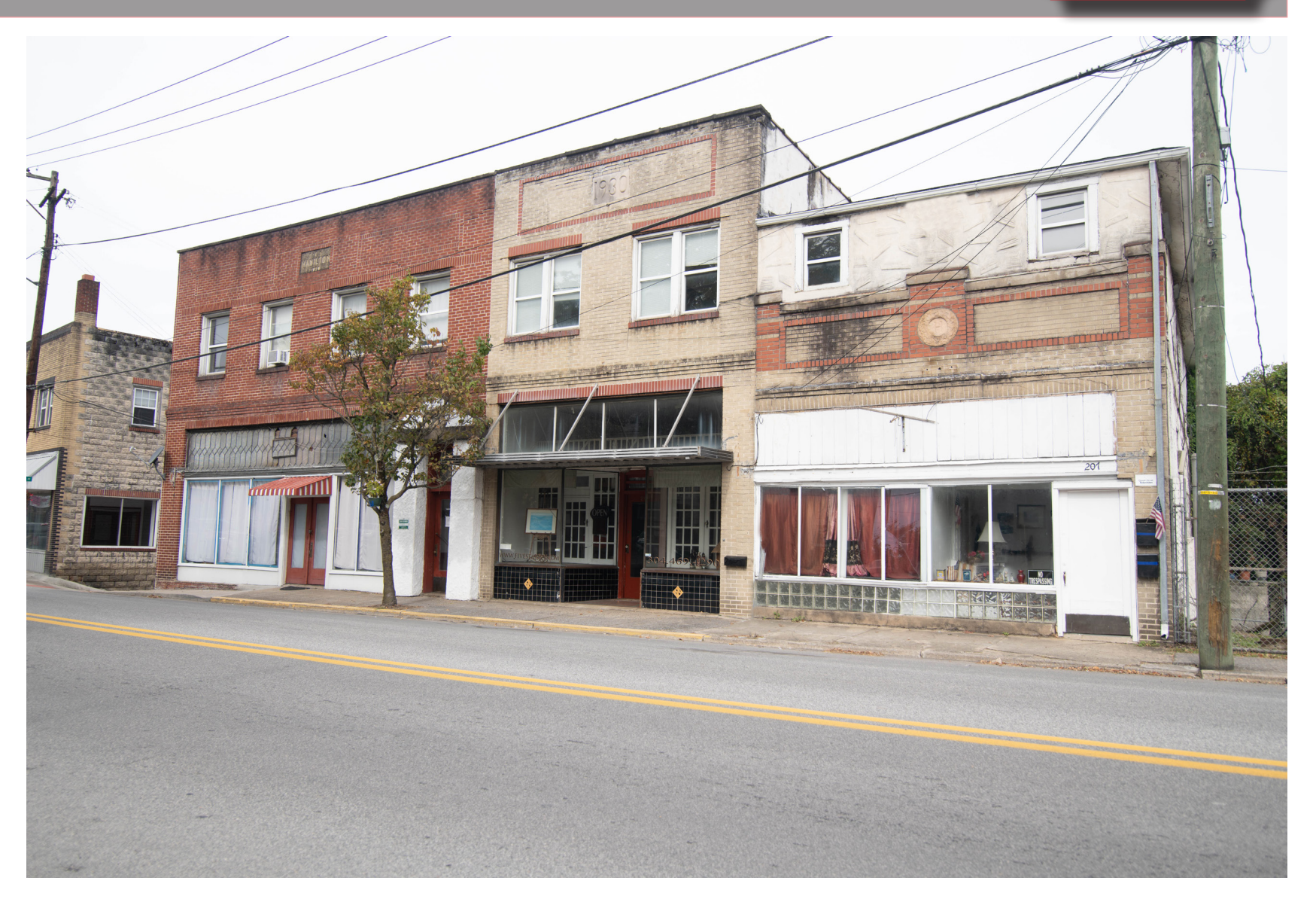
201 Main Street

Addition to top of building is out of character. Brick is dirty. Lack of overall character.