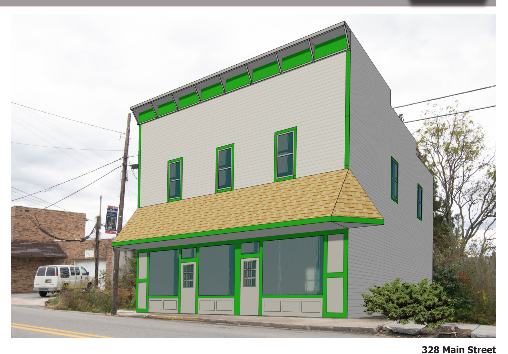
Replace false brick with siding, replace canopy.