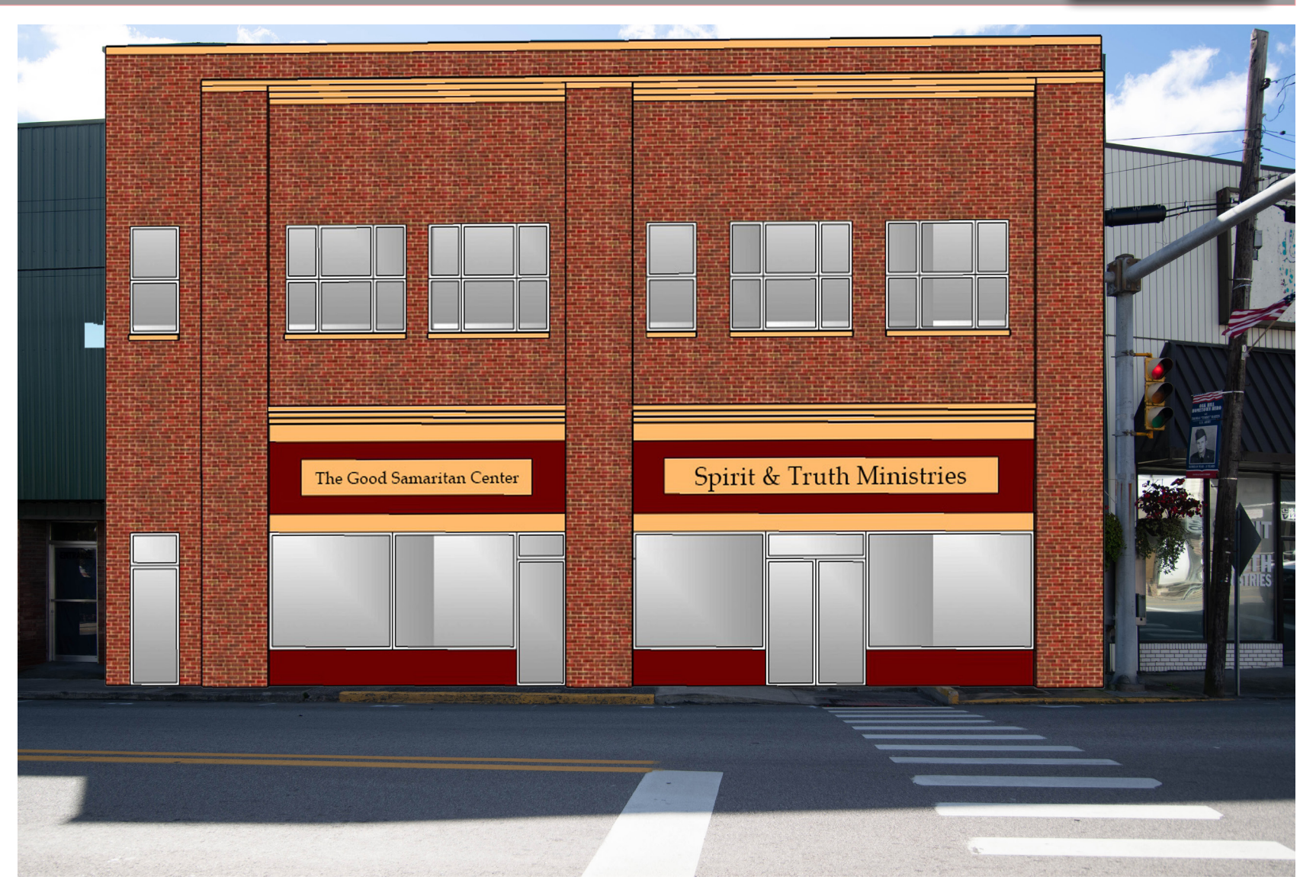
New color scheme brings out architectural features. New signage.