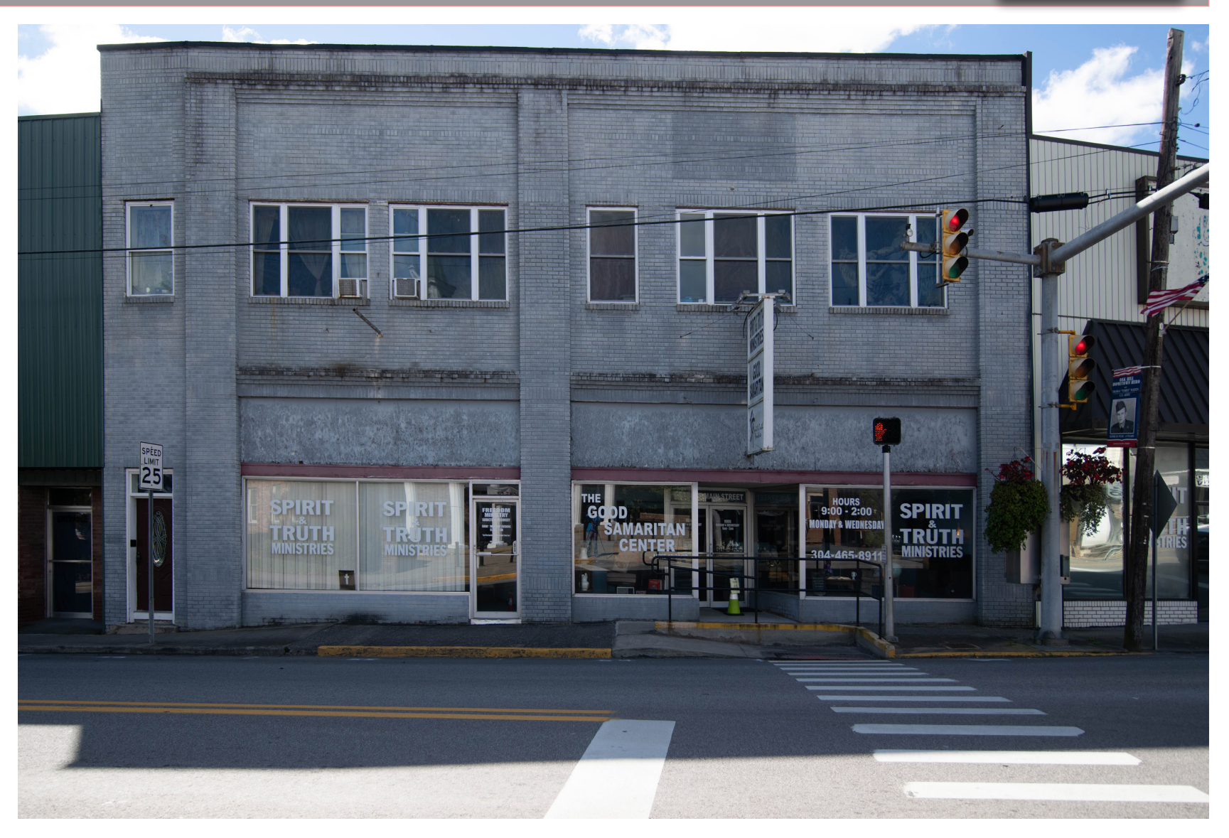
108 Main Street Color is drab, architectural features obscured. Too much signage.