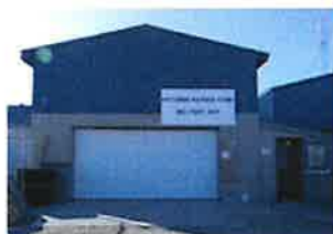
Kotzebue Package Store