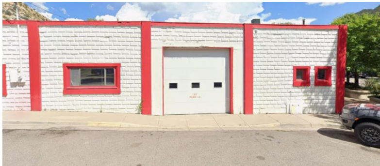
Original Garage Door