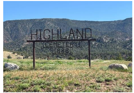
Newer Highland Cemetery Sign