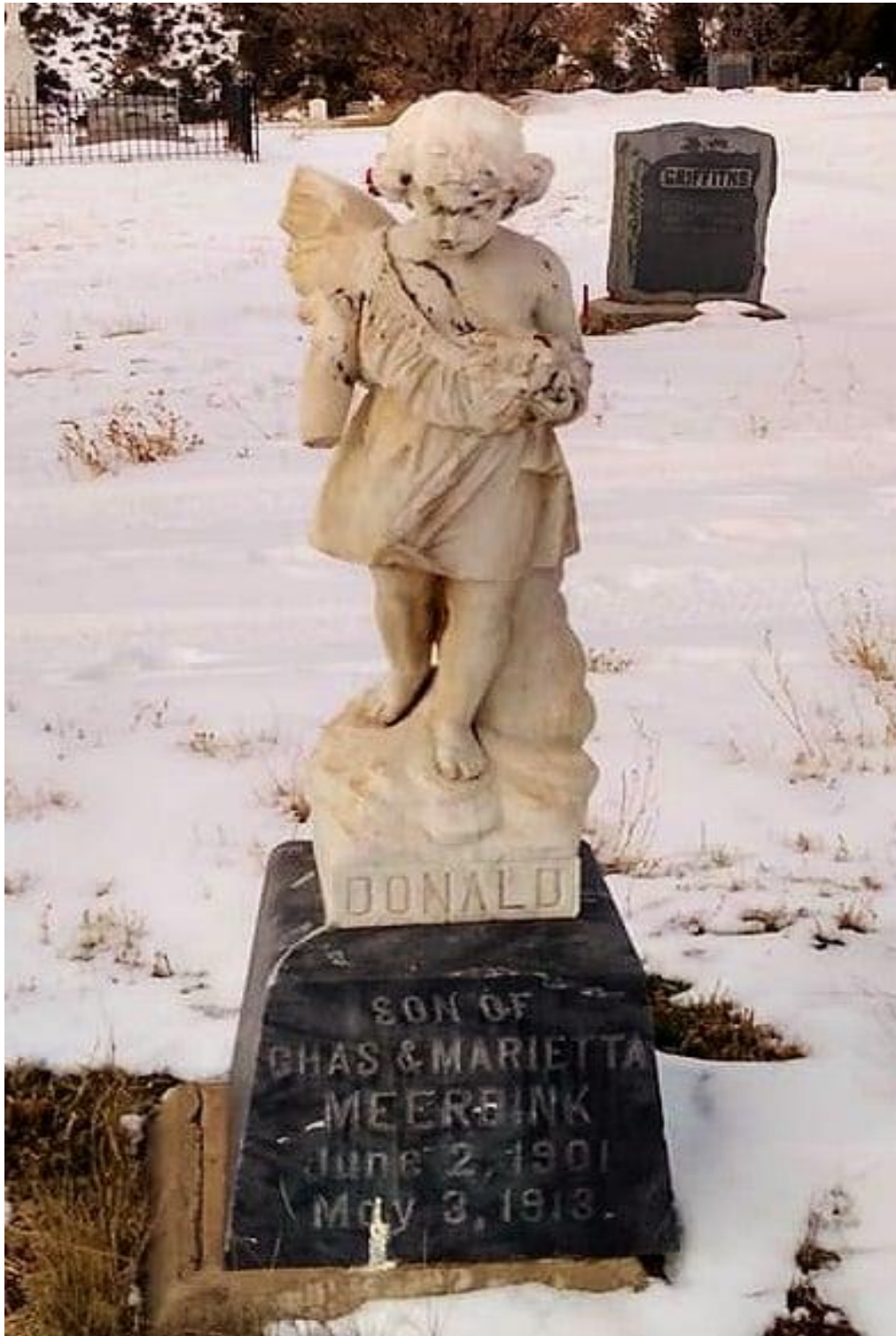
Child's Grave 1913