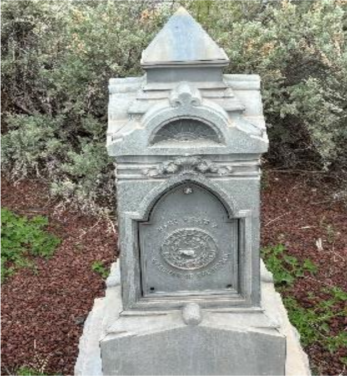
Woodsmen of the World Tombstone