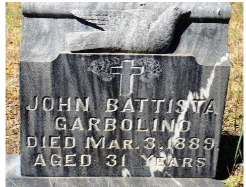
First Recorded Burial