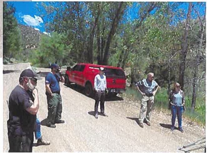
New Castle Focus: Field trip to Elk Run and The Cedars neighborhoods