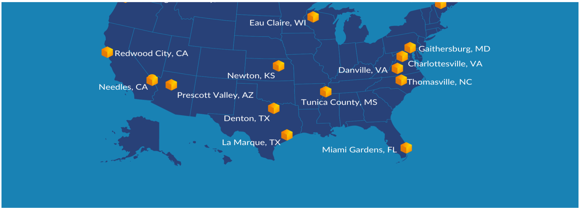
Local governments selected for ICMA's 2024 Economic Mobility and Opportunity Cohort

Fifteen cities, towns, and counties representing diverse populations, geographies, operating budgets, and other local conditions have been selected for ICMA's 2024 Economic Mobility and Opportunity Peer Learning Cohort and Grant Program. In addition to professional development and networking opportunities for their team leaders, the selected local governments will each receive a $20,000 grant to advance a local assessment, planning process, or program aimed at boosting upward mobility of residents. This program from ICMA is made possible by support from the Gates Foundation's Economic Mobility and Opportunity (EMO) program .