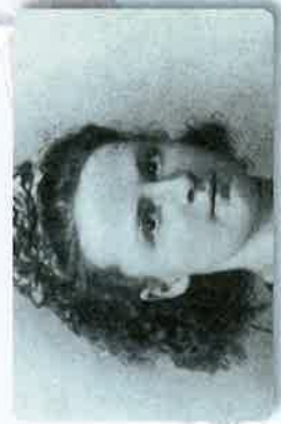
Louise Adolpha Le Beau