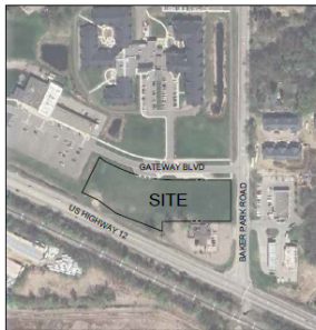
AERIAL LOCATION MAP