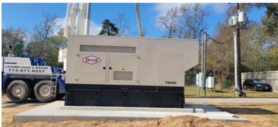
Figure 1: Newly Installed Generator January 11, 2023