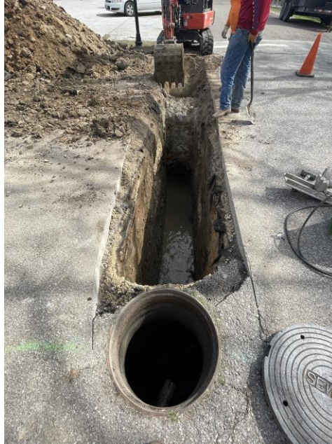
Figure 1: Point repair on McCown, February 6, 2023