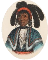
MICANOPY, SEMINOLE CHIEF