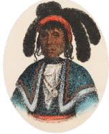
MICANOPY, SEMINOLE CHIEF