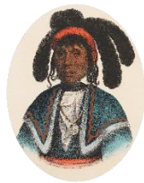
MICANOOPY, SEMINOLE CHIEF