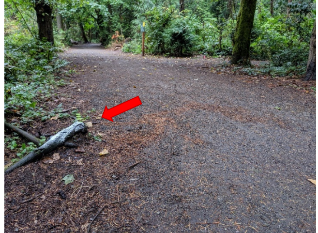
Example of trail edge roots

edges of the trail. Further inspection revealed that two of the in-trail intrusions were connected to dead trees and two originated from large, healthy trees.