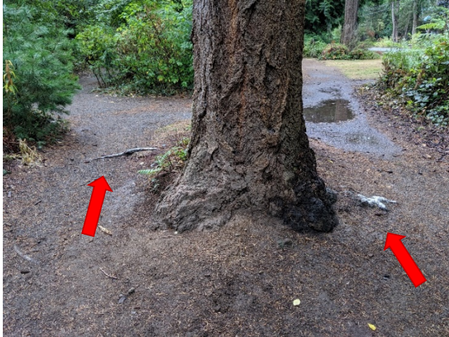
Example of in-trail root intrusions adjacent to a healthy tree