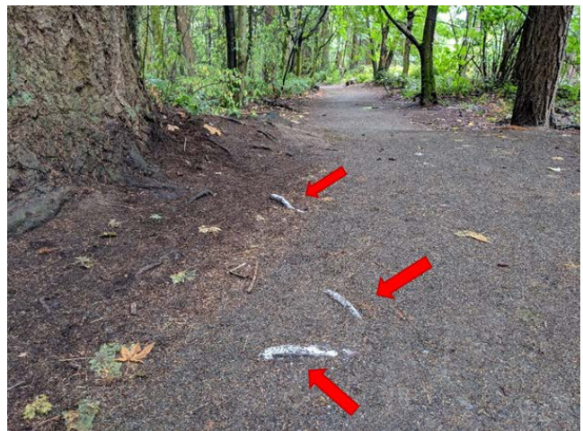
Example of in-trail and trail edge root intrusions

Parks staff assessed all root intrusions into the trail and found that there were four areas on the Perimeter Trail where roots are protruding above the trail surface, and many other areas where roots are well above the trail grade on the