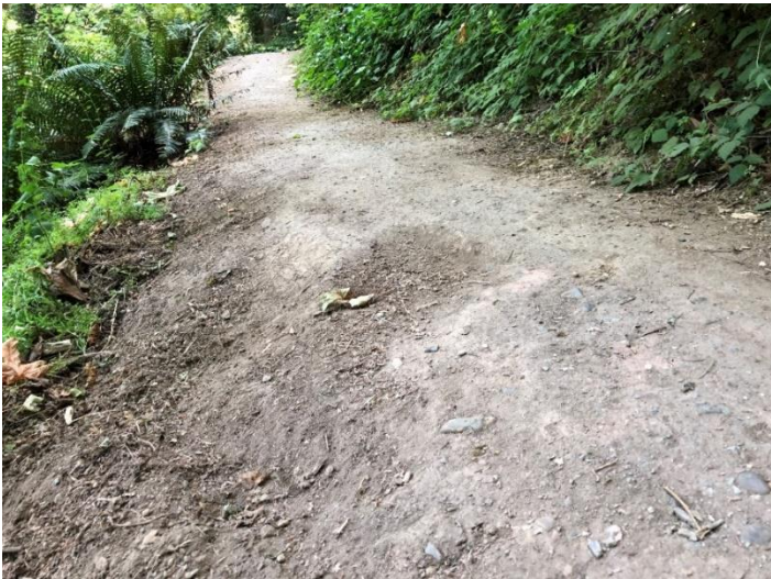
Trail surface eroding on steep sidehills