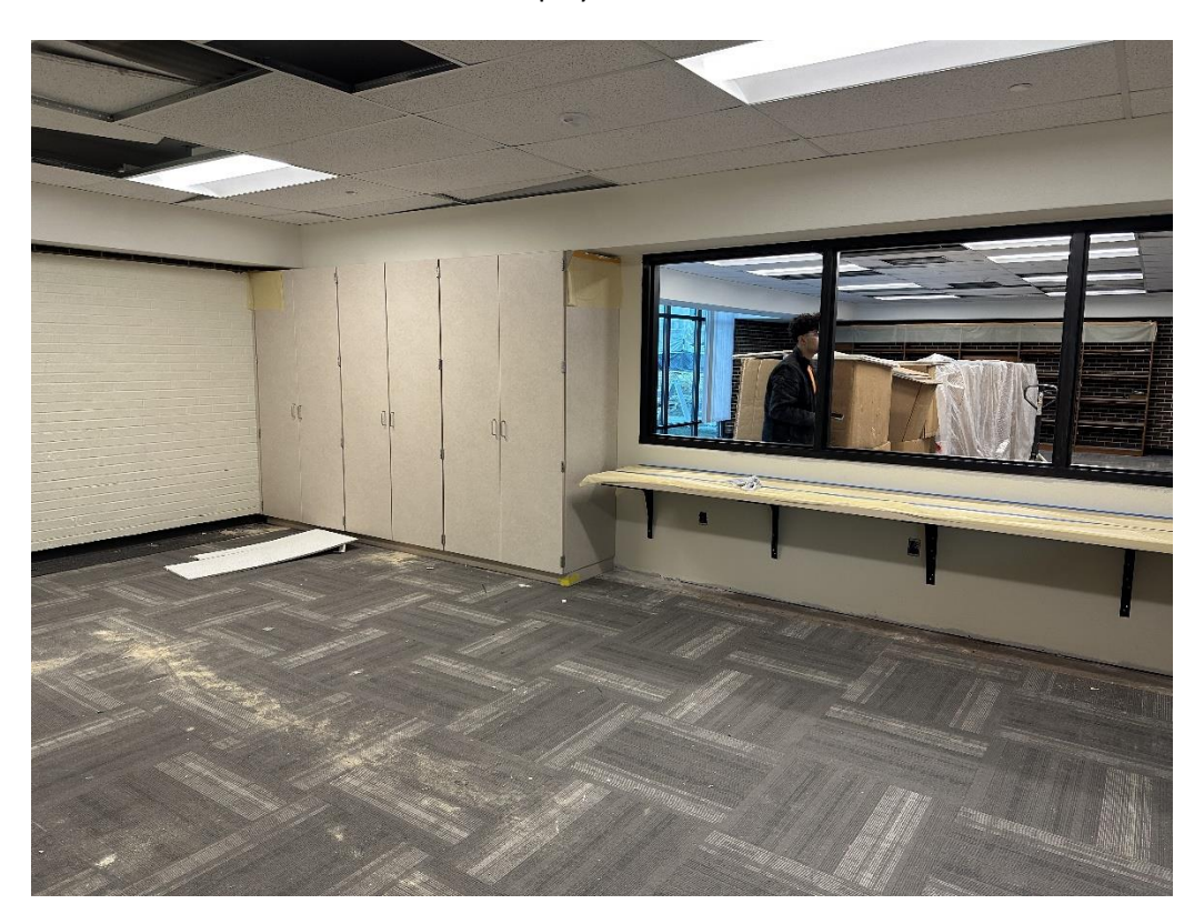
Cabinet on Left for Storage