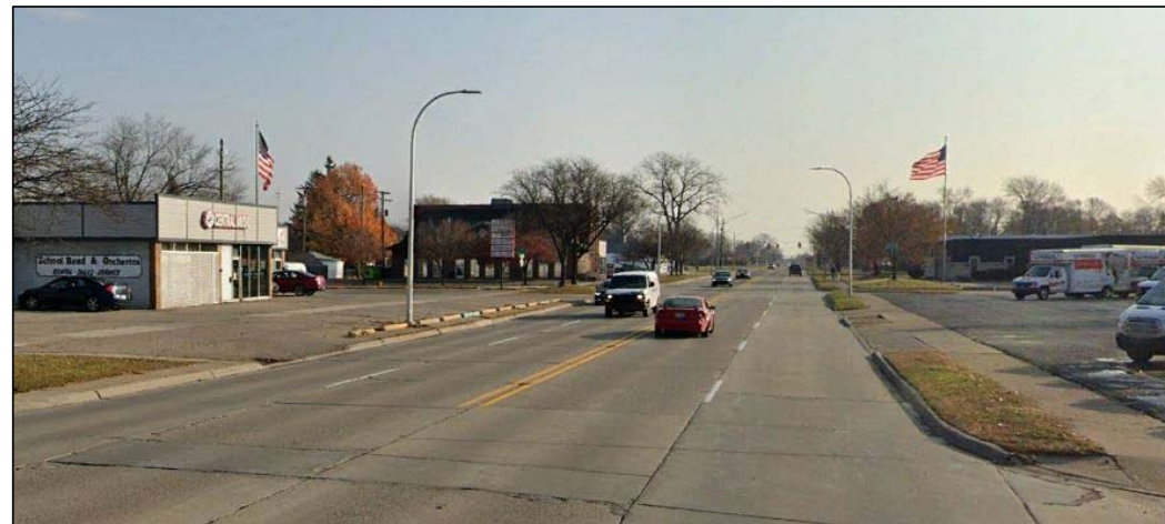
11 Mile Rd, Madison Heights, MI