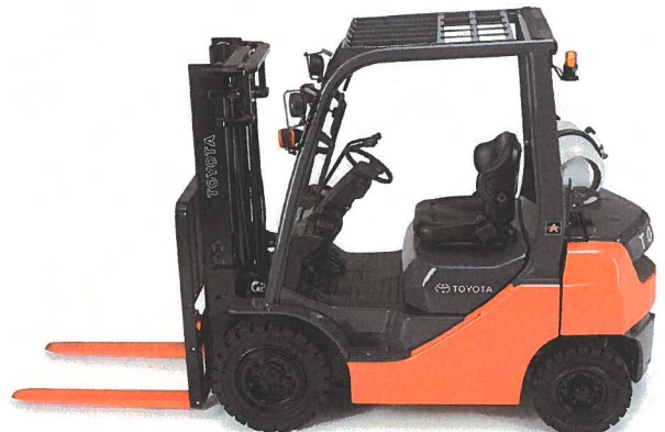
Photo may portray optional equipment not included in your quotation.

Mast 3-Stage (FSV) mast with full free lift. Mast specifications: Maximum Fork Height - 187" Overall Lowered Height - 89.2" (Overhead Guard Height - 85.50") Free Lift - 41.2" with standard Load Backrest