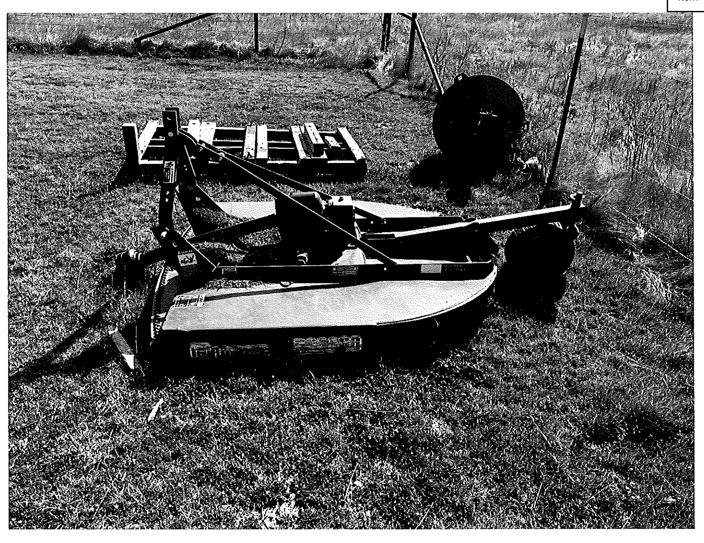
$ 2650.00 for New