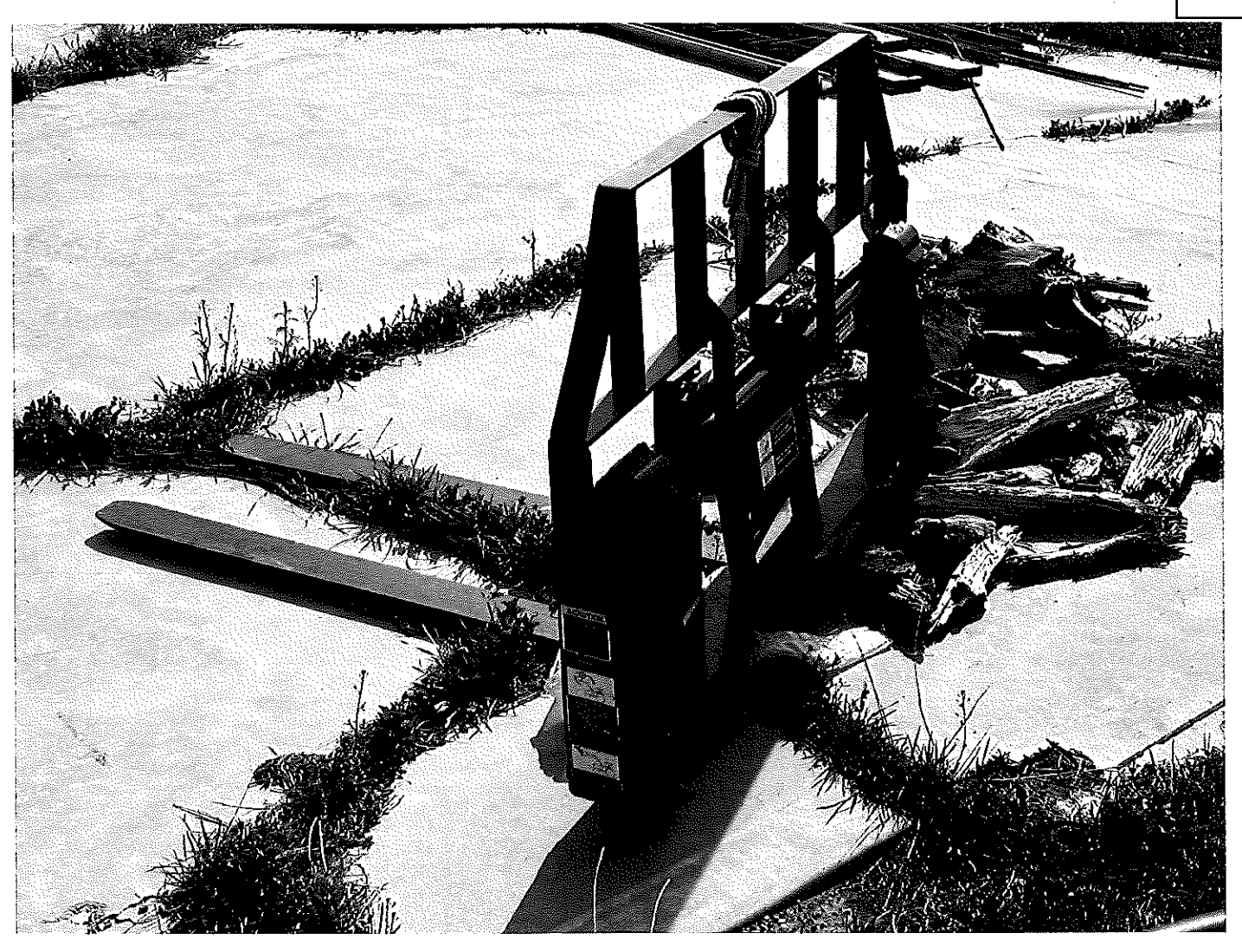
$ 1200.00 for new