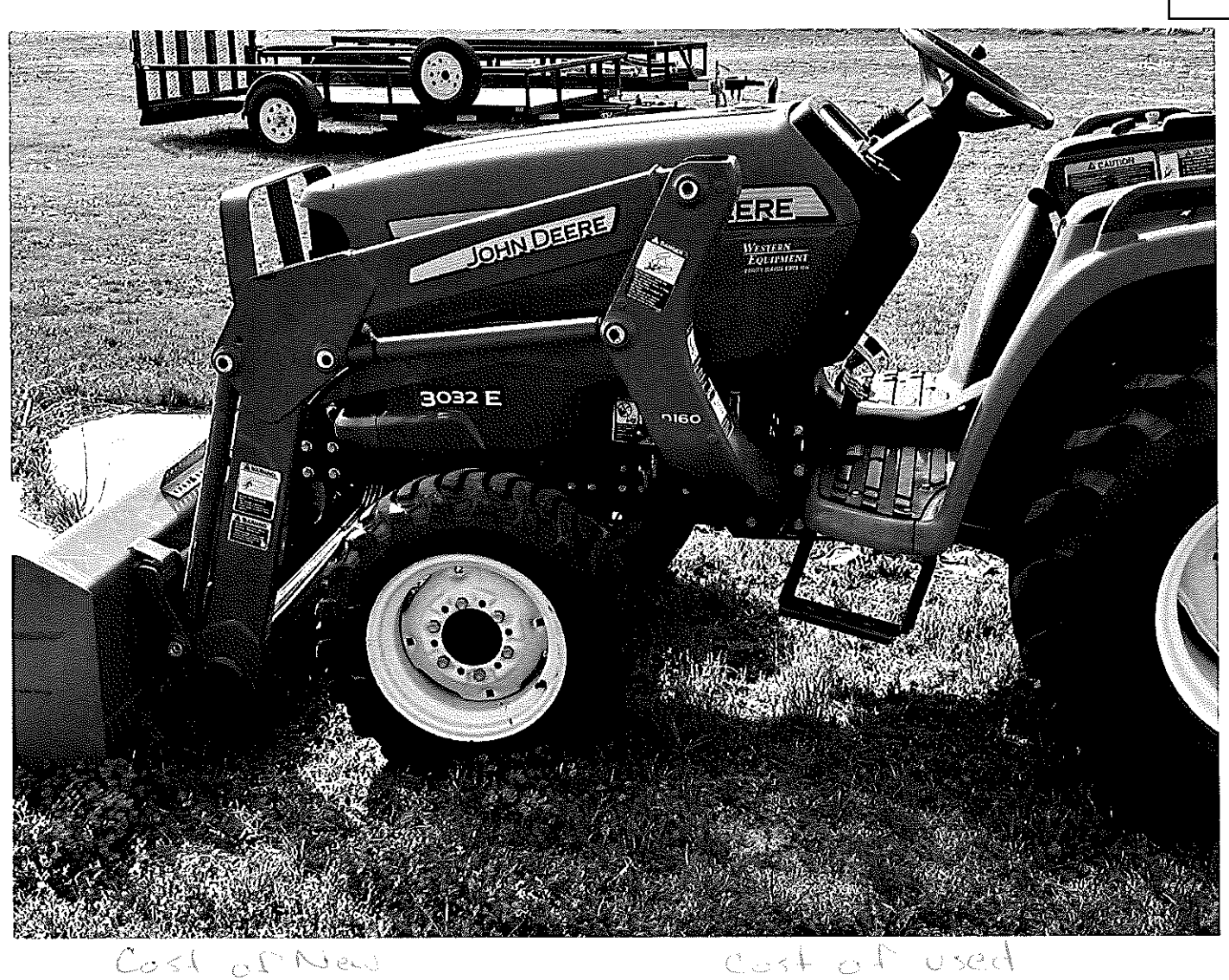
# 37,263.21 State bid new!