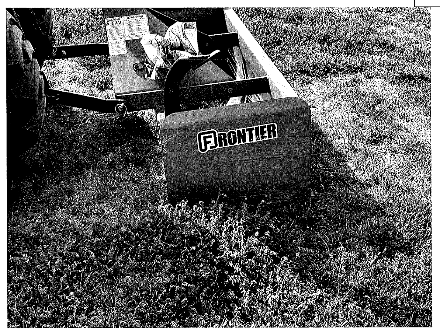
# 1350 00 for New