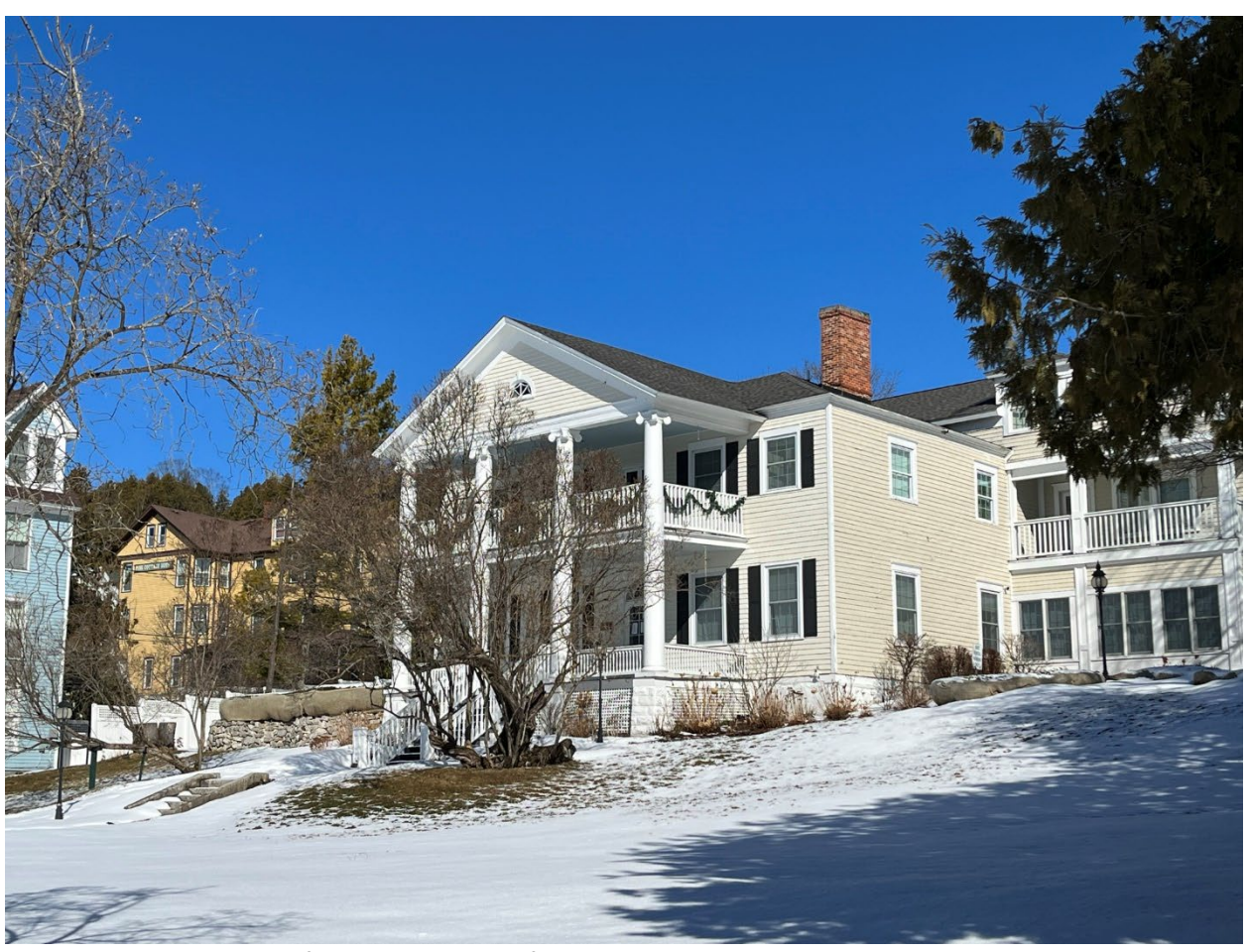
Photo 6. Harbour View Inn, formerly Madame Laframboise House, 6860 Main Street