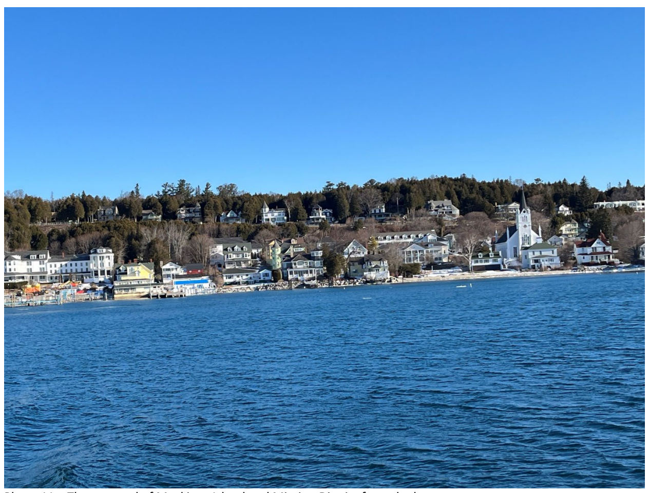
Photo 11 – The east end of Mackinac Island and Mission District from the bay.