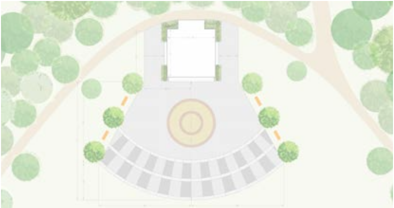
Oak Meadow Bandstand Area Improvement Project | Concept Plan Option 1 Fan Shape - Perspectives Town of Los Gatos