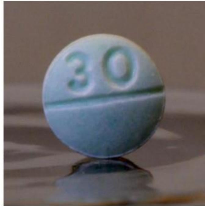
Counterfeit Oxycodone Back