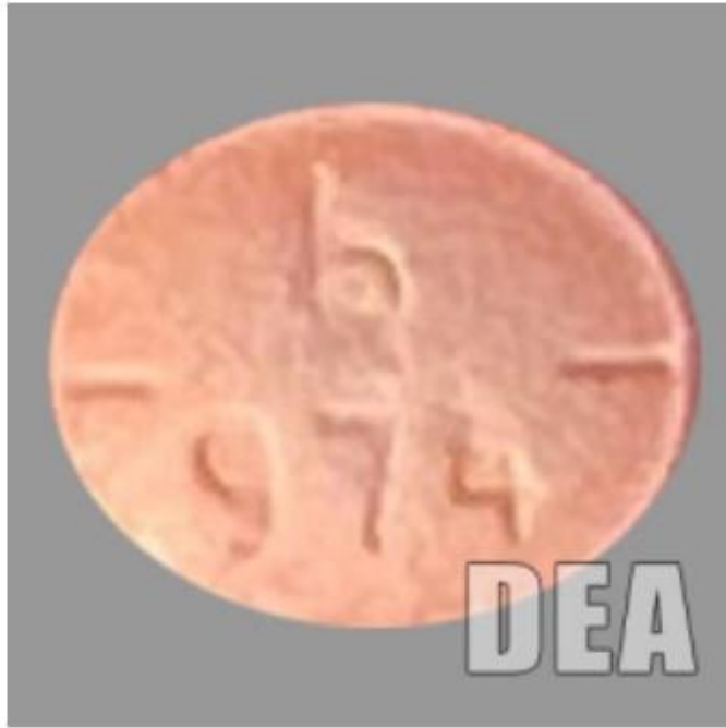
Counterfeit Adderall® Front

Street Names: A-Train; Abby; Addy; Amps; Christmas Trees; Co-Pilots; Lid Poppers; Smart Pills; Smarties; Study Buddies; Study Skittles; Truck Drivers; Zing