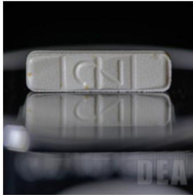
Authentic Xanax® Front