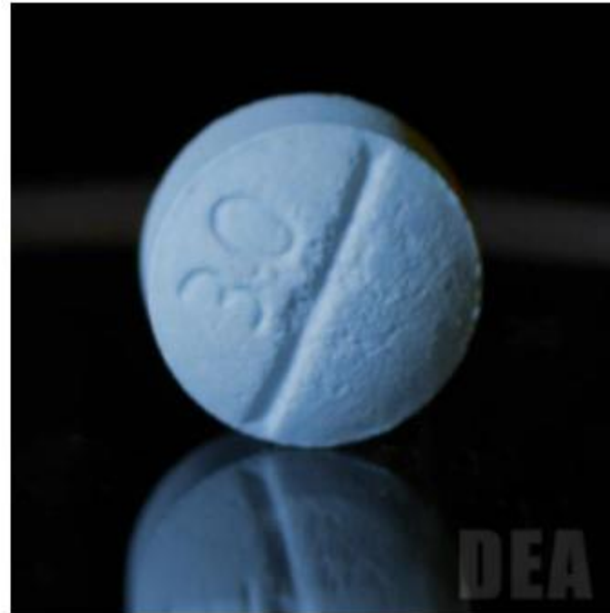
Authentic Oxycodone Back