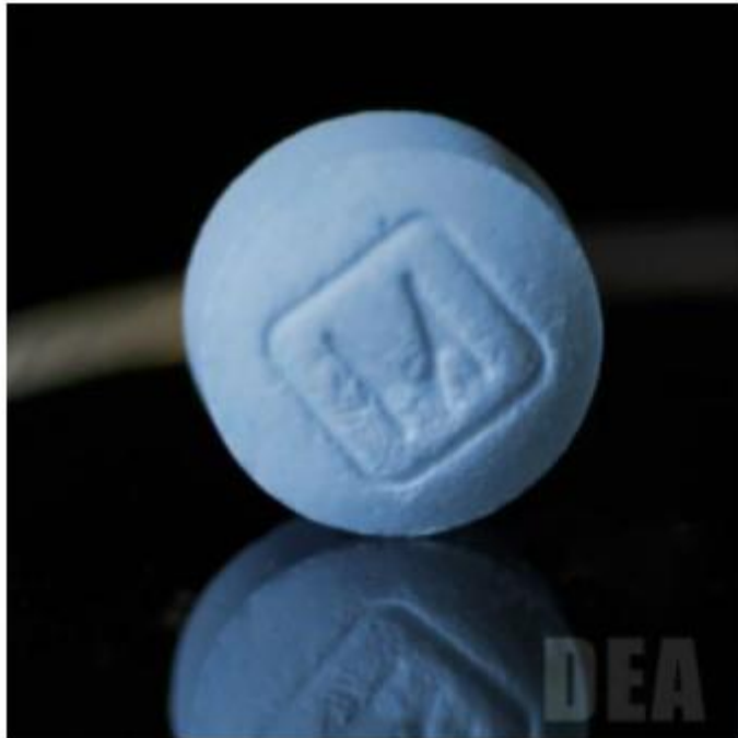
Authentic Oxycodone Front

Synthetic opioid drug prescribed for pain as OxyContin®, Tylox®, and Percodan®. These drugs are derived from one species of the poppy plant and have a high potential for abuse.