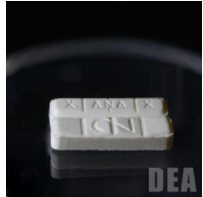
Authentic Xanax® Side by Side