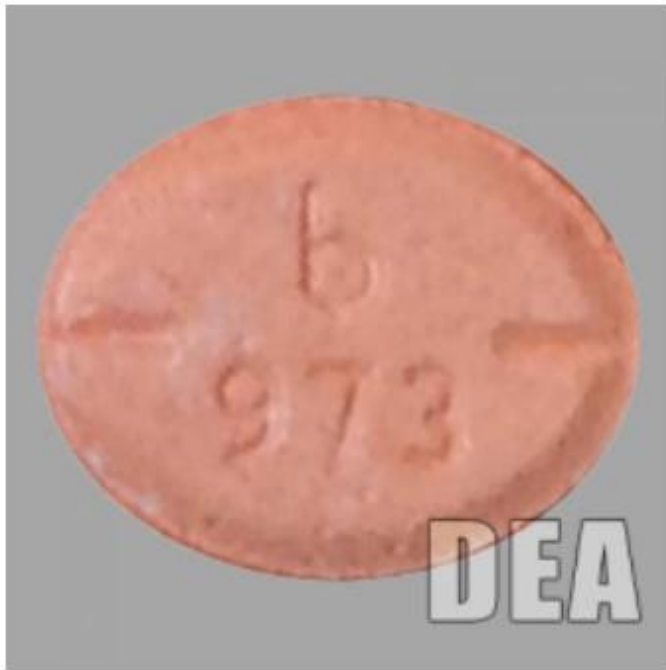
Authentic Adderall® Front

Prescription stimulants used to treat Attention-Deficit / Hyperactivity Disorder (ADHD). Used as a study aid, to stay awake, and to suppress appetites. Prescribed as Adderall®, Concerta®, Dexedrine®, Focalin®, Metadate®, Methylin®, Ritalin®.