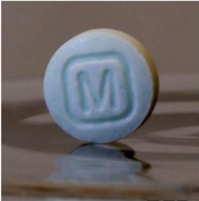
Counterfeit Oxycodone Front

Street Names: 30s; 40s; M30s; 512s; Beans; Blues; Buttons; Cotton; Greens; Hillbilly Heroin; Kickers; Killers; Muchachas; Mujeres; OC; Oxy; Oxy 80s; Roxy; Roxy Shorts; Whites