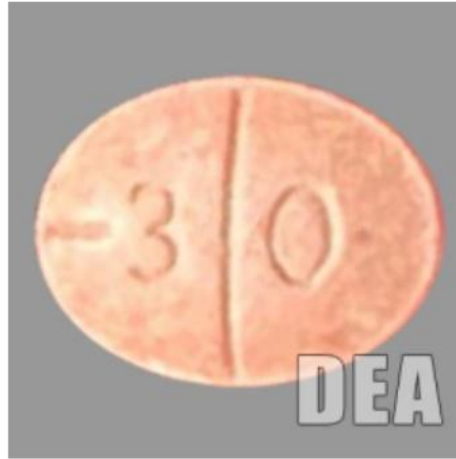
Counterfeit Adderall® Back