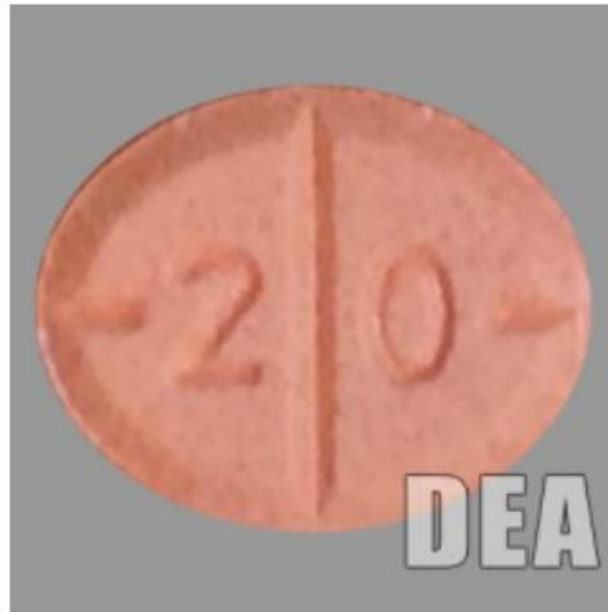
Authentic Adderall® Back