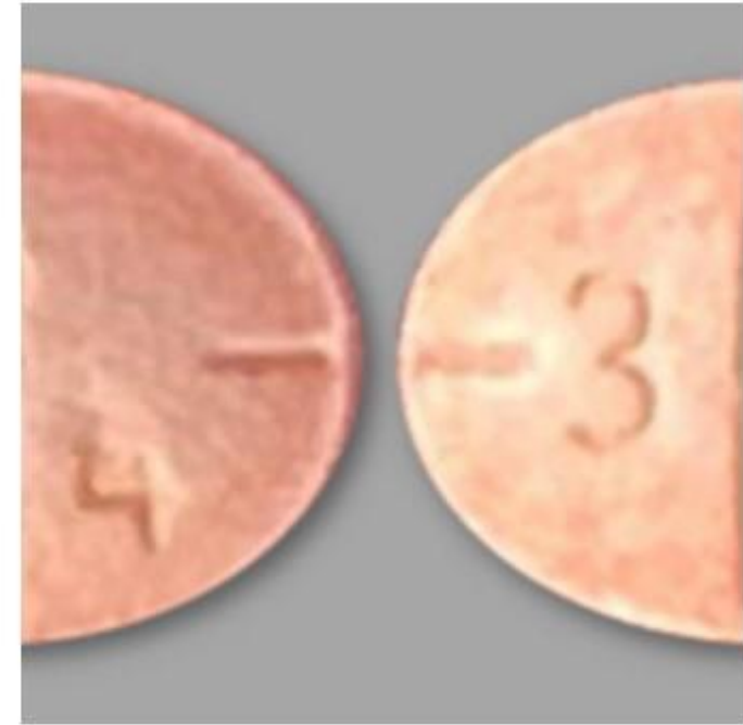
Counterfeit Adderall® Side by Side