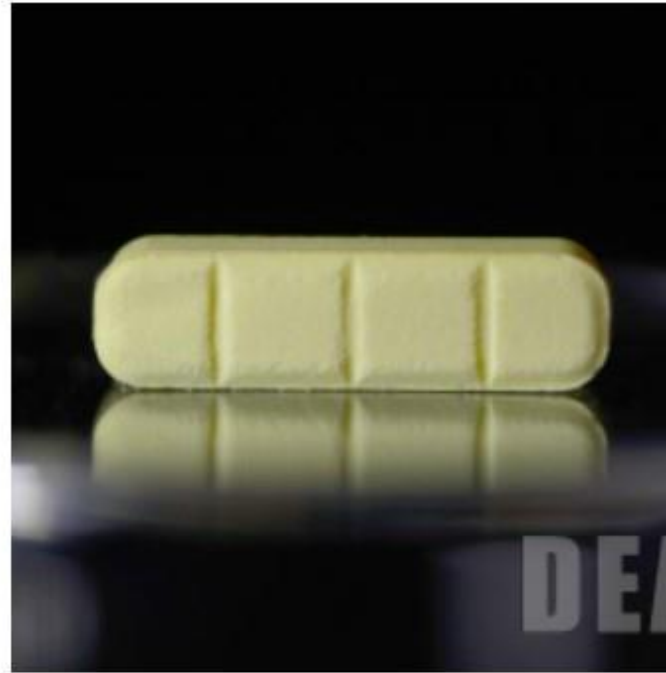
Counterfeit Xanax® Back