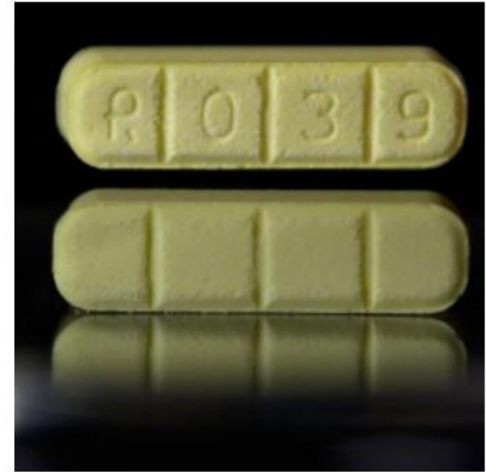
Counterfeit Xanax® Side by Side