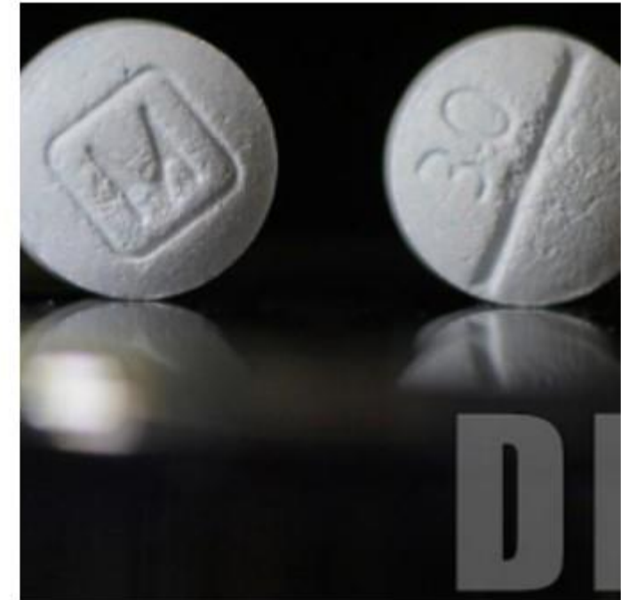
Authentic Oxycodone Side by Side