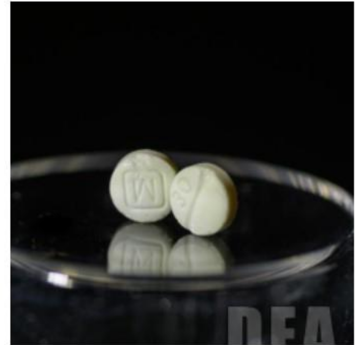
Counterfeit Oxycodone Side by Side