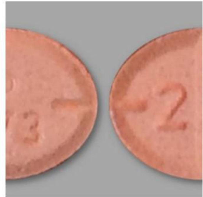
Authentic Adderall® Side by Side