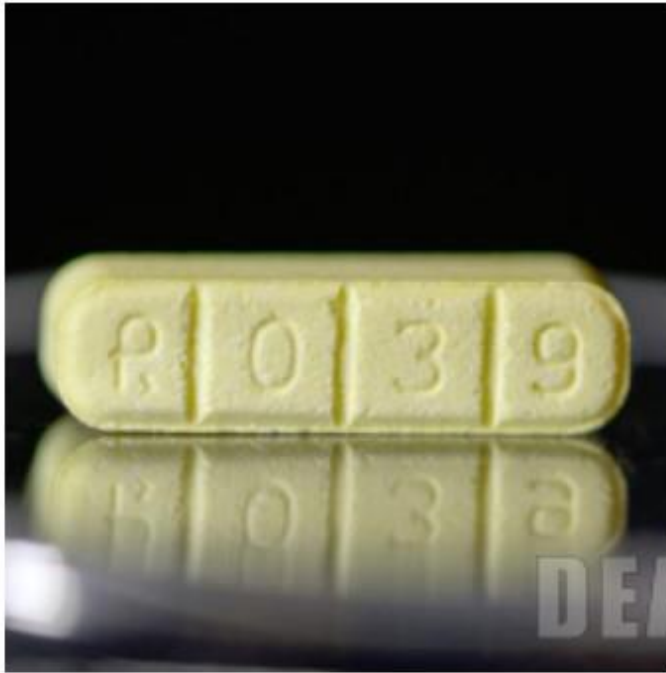
Counterfeit Xanax® Front

Street Names: Bars; Benzos; Bicycle Handle Bars; Bicycle Parts; Bricks; Footballs; Handlebars; Hulk; Ladders; Planks; School Bus; Sticks; Xanies; Yellow Boys; Zanbars; Zannies; Z-Bars