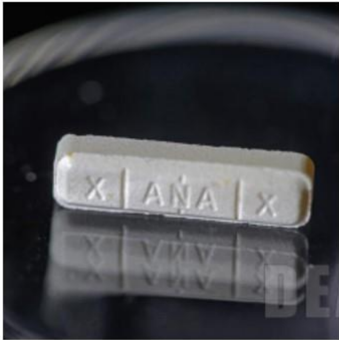
Authentic Xanax® Back

Depressants that produce sedation, induce sleep, relieve anxiety and prevent seizures. Available in prescription pills, syrup and injectable preparation. Prescribed as Valium®, Xanax®, Restoril®, Ativan®, Klonopin®