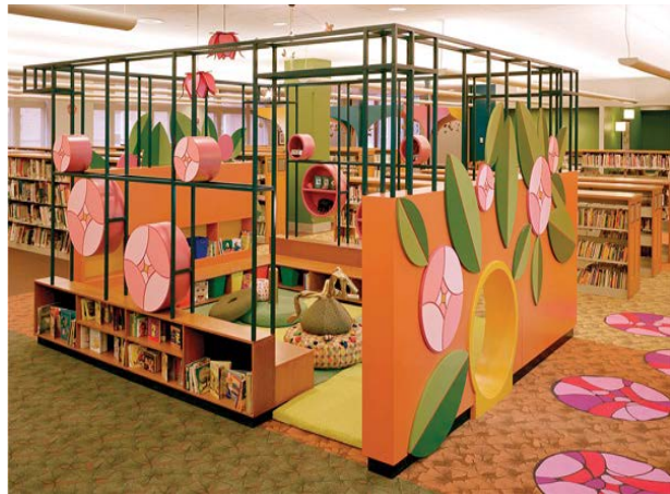
Dynamic Early Learning Spaces