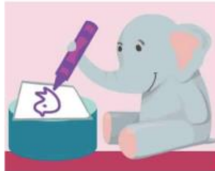
Saturday, May 13 • 11am Theme: Language & Communication