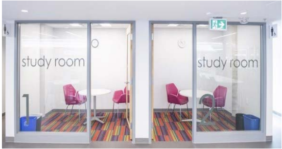
Library tutor rooms