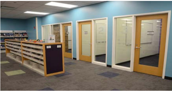
Library group study rooms

In contrast, the Los Altos Library provides one large room for teen study. Tutors often tutor students in the open leading to a lack of privacy and noise.