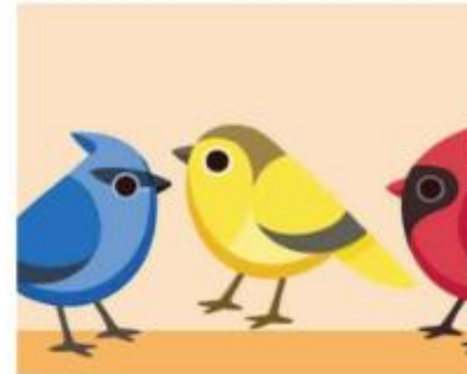
Sunday, May 28 • 1pm Theme: Science