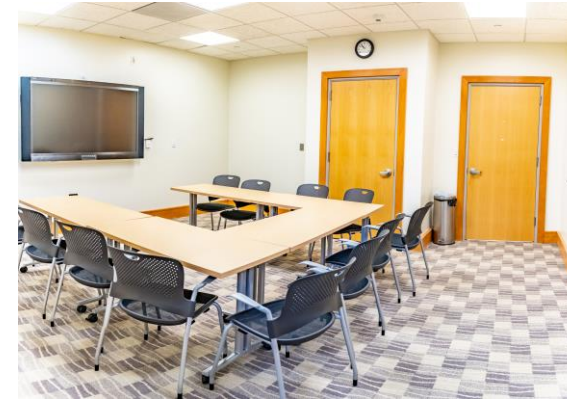
Saratoga (48.5k ft 2 )