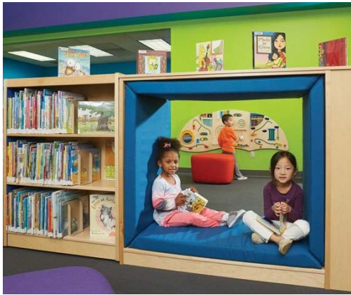
Creative Reading Spaces