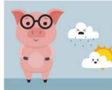
Sunday, April 23 • 1pm Theme: Health & Wellbeing