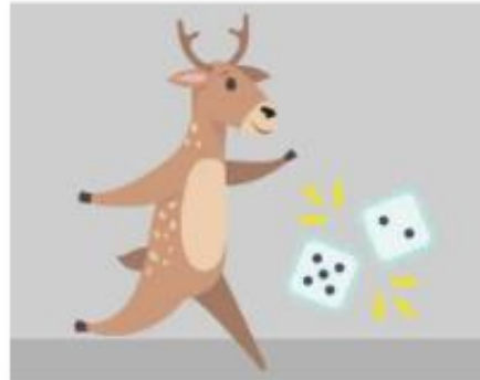
Saturday, April 8 • 11am Theme: Math

Join us for stories, movement, and joyful play in the Los Altos Library Orchard Room For children who will be entering kindergarten or transitional kindergarten in 2023.