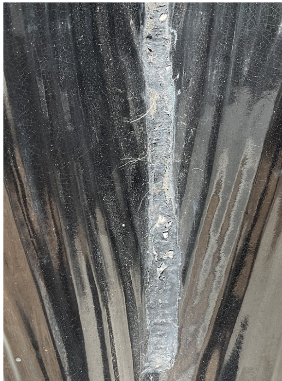
Detail Showing Flaking and Loss in Glaze