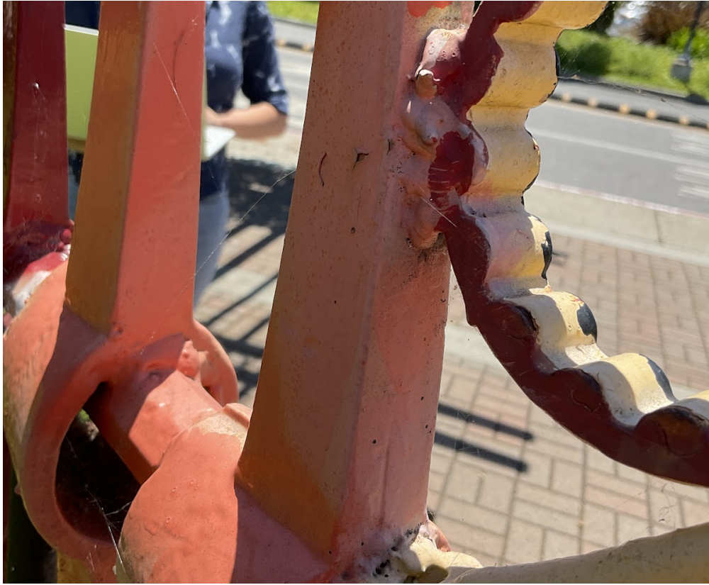
Detail Showing Blisters in Paint and Possible Corrosion