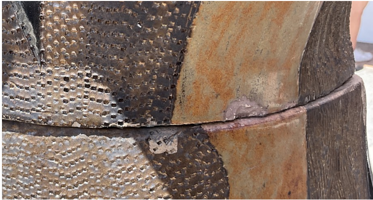
Detail Showing Losses Along Join