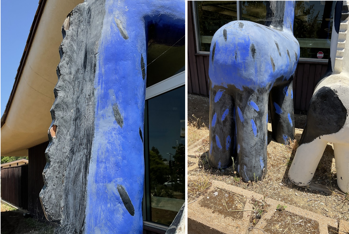
Detail of Losses Exposing Underlying Wood