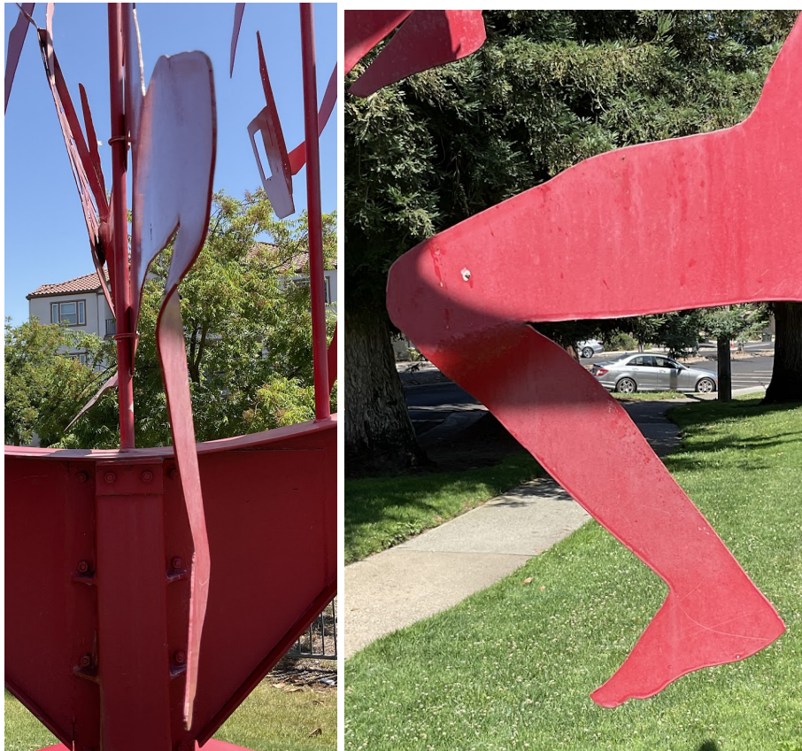
Details Showing Two Views of the Bend in Lower Figure's Leg