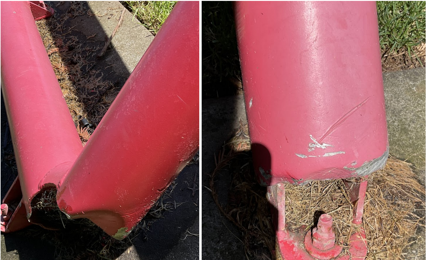
Details Showing Dents and Abrasions on the Bottom of the Lower Tubes