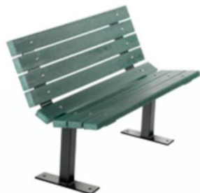
Model PB4-CON | Green