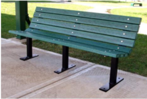
Model PB6-CON | Green