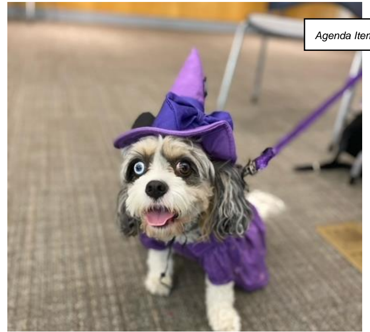
Agenda Item 9.