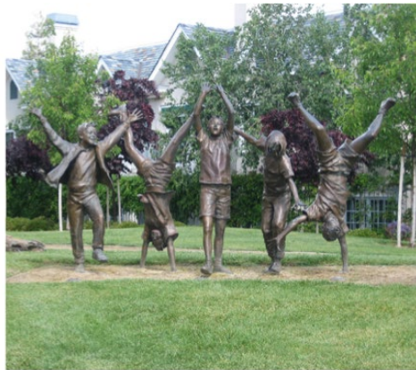
Los Altos Public Arts Commission

Partner with Parks & Recreation Commission to host a community engagement event to promote public art and local parks while gathering input from residents to further the commissions' roles in advising the City Council and advancing the City's mission to "foster and maintain the City of Los Altos as a great place to live and to raise a family."