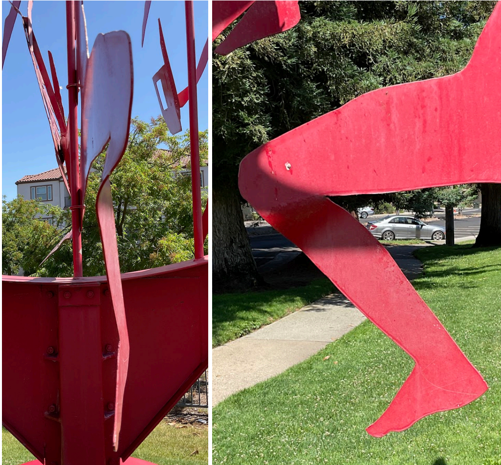
Details Showing Two Views of the Bend in Lower Figure's Leg