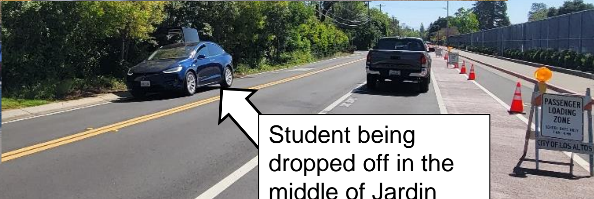
Student being dropped off in the middle of Jardin