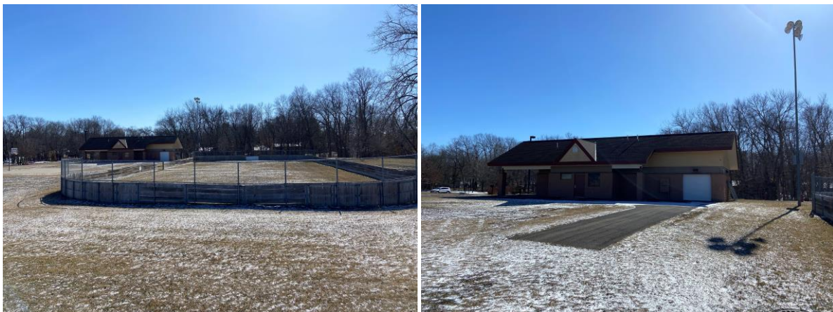
Holbrook Park has several needed improvements, including upgrading the existing outdoor ice rink, activating the existing warming house, and completing the internal paved trail to expand accessibility for all ages and abilities within the park.

Holbrook Park provides a variety of recreation facilities, including a ballfield, half basketball court, a playground, and the existing unpaved ice rink area, as well as paved and unpaved trails. The ice rink area is aging and underutilized for several reasons. In the winter, the Holbrook Park seasonal ice rink is unpaved and the ice surface is directly exposed to the ground; as a result, soil temperature variation and moisture accumulation lead to inconsistent ice quality. Inconsistent ice quality at the Holbrook Park ice rink results in puddles, bumps, and rough patches, which make skating difficult and potentially hazardous to the public, shortens the skating season, damages the park’s natural environment, and results in cost-inefficient maintenance and materials requirements. Further, as the rink area lies on natural turf with no piping or refrigeration, flooding the ~17,000 square-foot lawn area seasonally requires substantial manual effort and resources from the City’s Public Works Department. In the summer, the rink area serves as an off-leash dog area that is unshaded and has no improvements to support high-quality or diverse dog recreation. The safety barriers/boards are also aging wood and installed permanently, which prevents flexible or secondary use of the area during transitional seasons or when conditions do not support the primary users of the space.