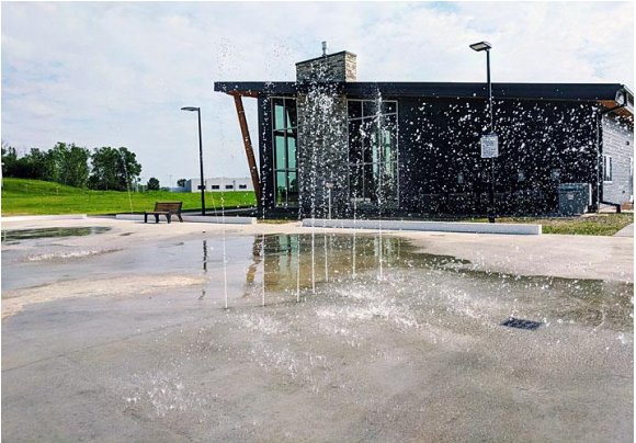
Logie Park Lindsay, ON