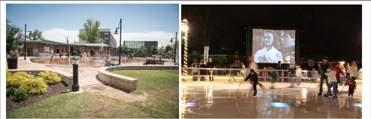
The Project would create an all-season recreation facility in Long Lake, the first of its kind in the area, combining a winter refrigerated ice rink with a summertime splash plaza. This combination has been successful in many community parks, including Lawrence Plaza in Bentonville, AR (pictured), where community events such as outdoor movies occur concurrent with the recreational activities. See Figure 2 for additional examples.

As a first phase, the Project would replace and realign the existing unpaved outdoor seasonal ice skating area with a permanent all-season recreation facility. In its place, a new facility would ingeniously combine an outdoor refrigerated ice rink with a splash plaza and community picnic patio (see Figure 2 for examples of ice rink/splash pad combination facilities). The outdoor, open-air recreational facility would support ice skating, youth and adult hockey, and special events (e.g., broomball tournaments, skating lessons, or demonstrations) during colder months. During warmer months, the facility would transform into a surfaced gathering area providing a splash plaza/cooling center, patio and gathering area, and seating. The Project could also include a small covered stage or platform to support sports scorekeeping/announcing, picnicking, parties, roller skating, and special events such as movies in the park or small community music performances.