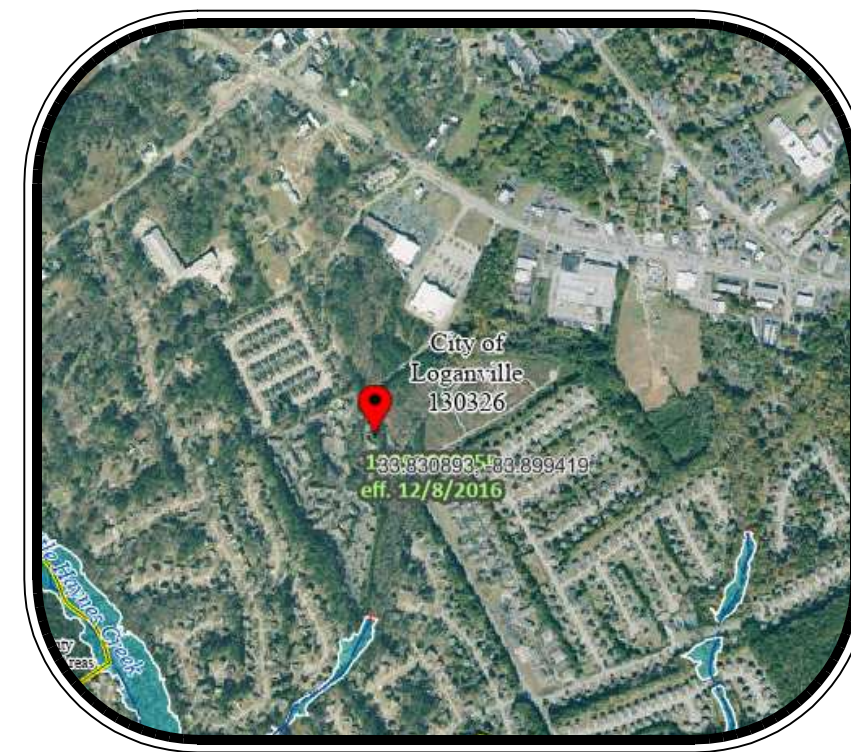
FIRM PANEL NO. 13297C0085E