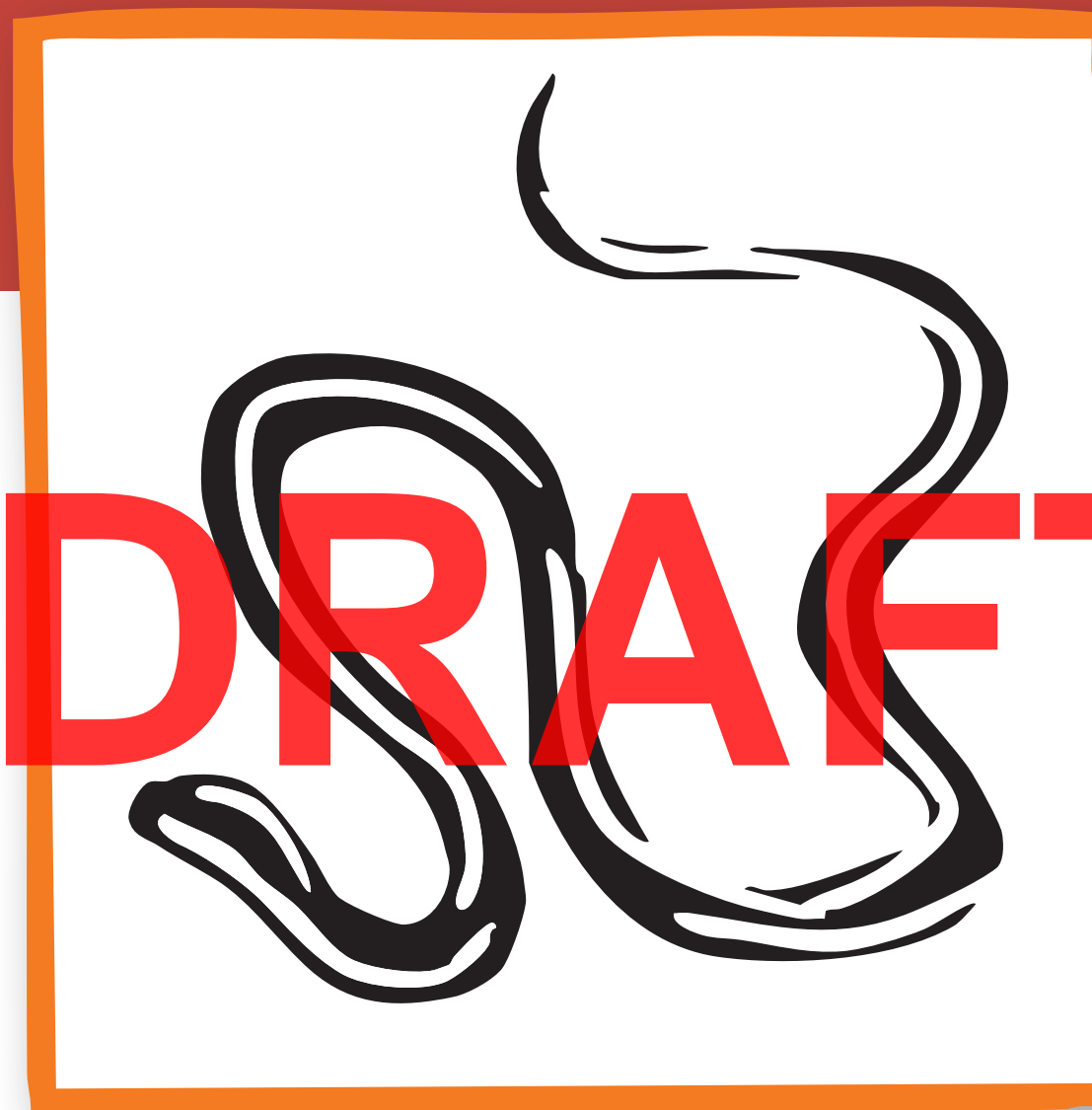
Puget Sound Garter Snake Thamnophis sirtalis

Lorem ipsum dolor sit amet, consectetur adipiscing elit. Sed do eiusmod tempor incididunt ut labore et dolore magna aliqua. Ut enim ad minim veniam, quis nostrud exercitation ullamco laboris nisi ut aliquip ex ea commodo consequat. Duis aute irure dolor in reprehenderit in voluptate velit esse cillum dolore eu fugiat nulla pariatur. Excepteur sint occaecat cupidatat non proident, sunt in culpa qui officia deserunt mollit anim id est laborum.