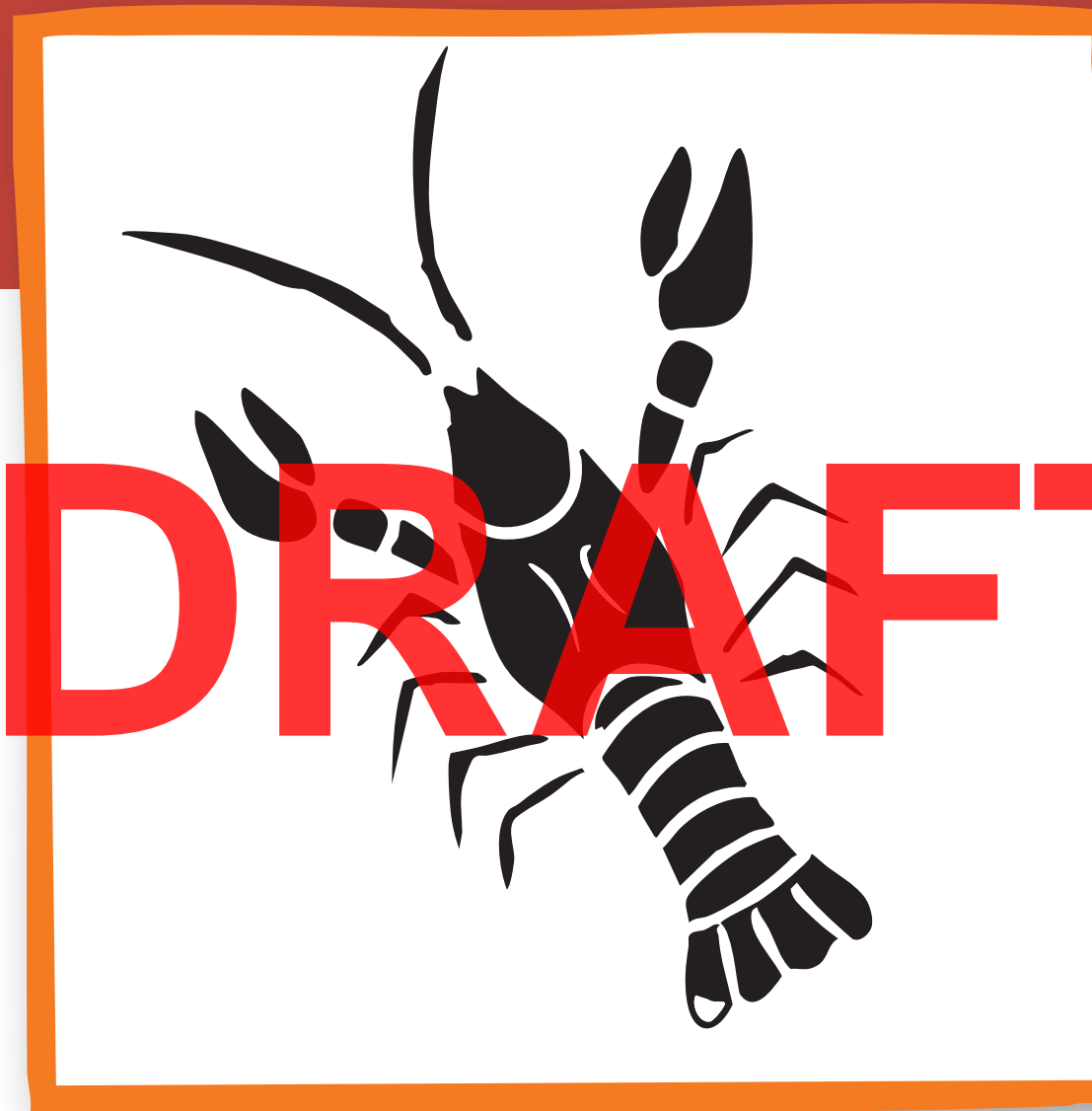
Signal Crayfish Pacifastacus leniusculus

Lorem ipsum dolor sit amet, consectetur adipiscing elit. Sed do eiusmod tempor incididunt ut labore et dolore magna aliqua. Ut enim ad minim veniam, quis nostrud exercitation ullamco laboris nisi ut aliquip ex ea commodo consequat. Duis aute irure dolor in reprehenderit in voluptate velit esse cillum dolore eu fugiat nulla pariatur. Excepteur sint occaecat cupidatat non proident, sunt in culpa qui officia deserunt mollit anim id est laborum.