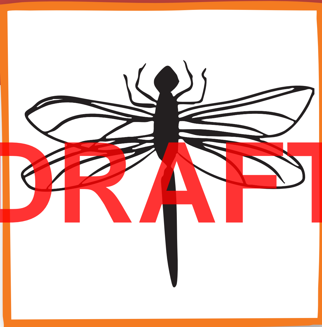
Common Green Darner Anax junius

Lorem ipsum dolor sit amet, consectetur adipiscing elit. Sed do eiusmod tempor incididunt ut labore et dolore magna aliqua. Ut enim ad minim veniam, quis nostrud exercitation ullamco laboris nisi ut aliquip ex ea commodo consequat. Duis aute irure dolor in reprehenderit in voluptate velit esse cillum dolore eu fugiat nulla pariatur. Excepteur sint occaecat cupidatat non proident, sunt in culpa qui officia deserunt mollit anim id est laborum.