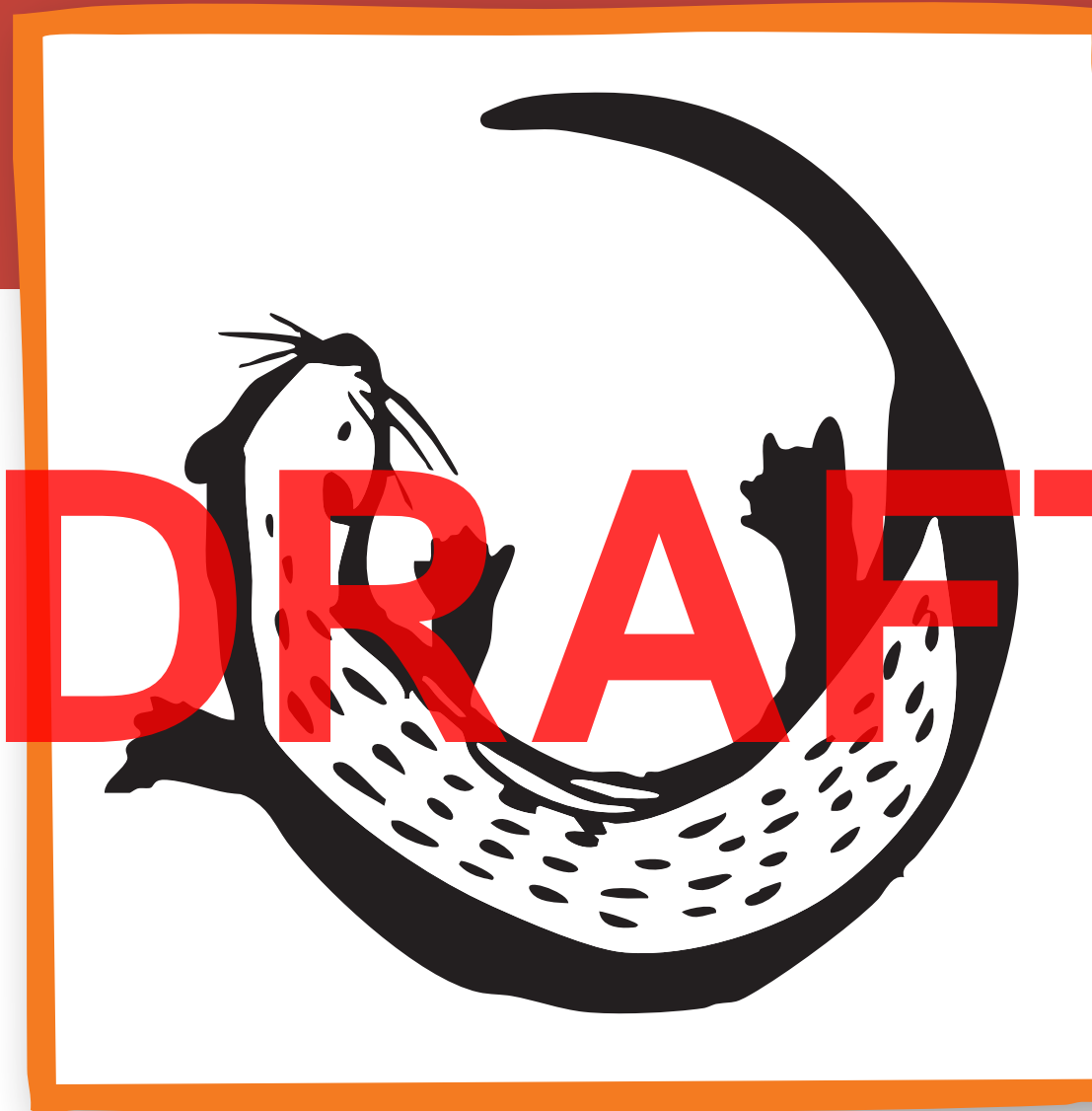
River Otter Lontra canadensis

Lorem ipsum dolor sit amet, consectetur adipiscing elit. Sed do eiusmod tempor incididunt ut labore et dolore magna aliqua. Ut enim ad minim veniam, quis nostrud exercitation ullamco laboris nisi ut aliquip ex ea commodo consequat. Duis aute irure dolor in reprehenderit in voluptate velit esse cillum dolore eu fugiat nulla pariatur. Excepteur sint occaecat cupidatat non proident, sunt in culpa qui officia deserunt mollit anim id est laborum.