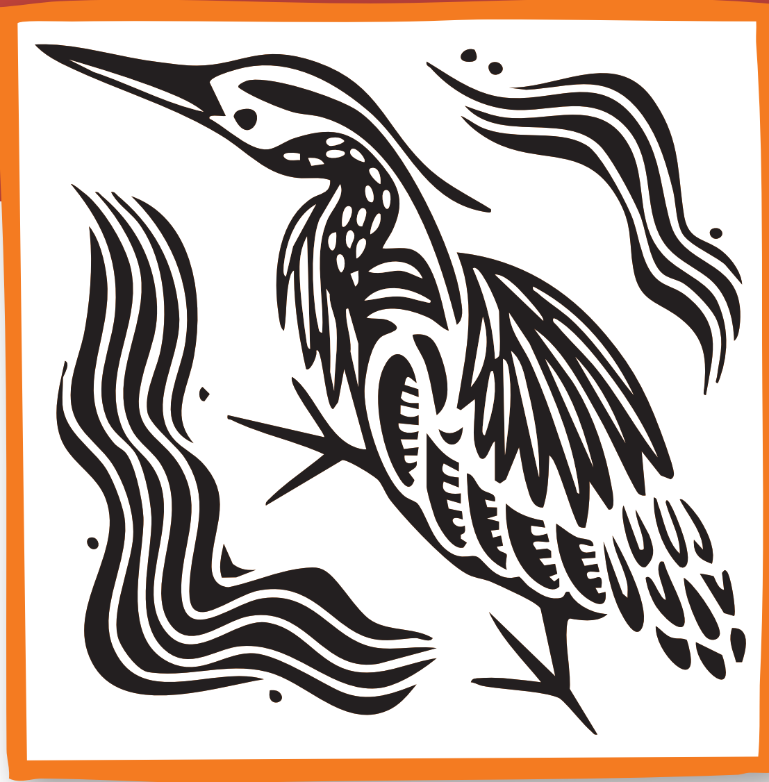
Great Blue Heron Ardea herodias

Lorem ipsum dolor sit amet, consectetur adipiscing elit. Sed do eiusmod tempor incididunt ut labore et dolore magna aliqua. Ut enim ad minim veniam, quis nostrud exercitation ullamco laboris nisi ut aliquip ex ea commodo consequat. Duis aute irure dolor in reprehenderit in voluptate velit esse cillum dolore eu fugiat nulla pariatur. Excepteur sint occaecat cupidatat non proident, sunt in culpa qui officia deserunt mollit anim id est laborum.