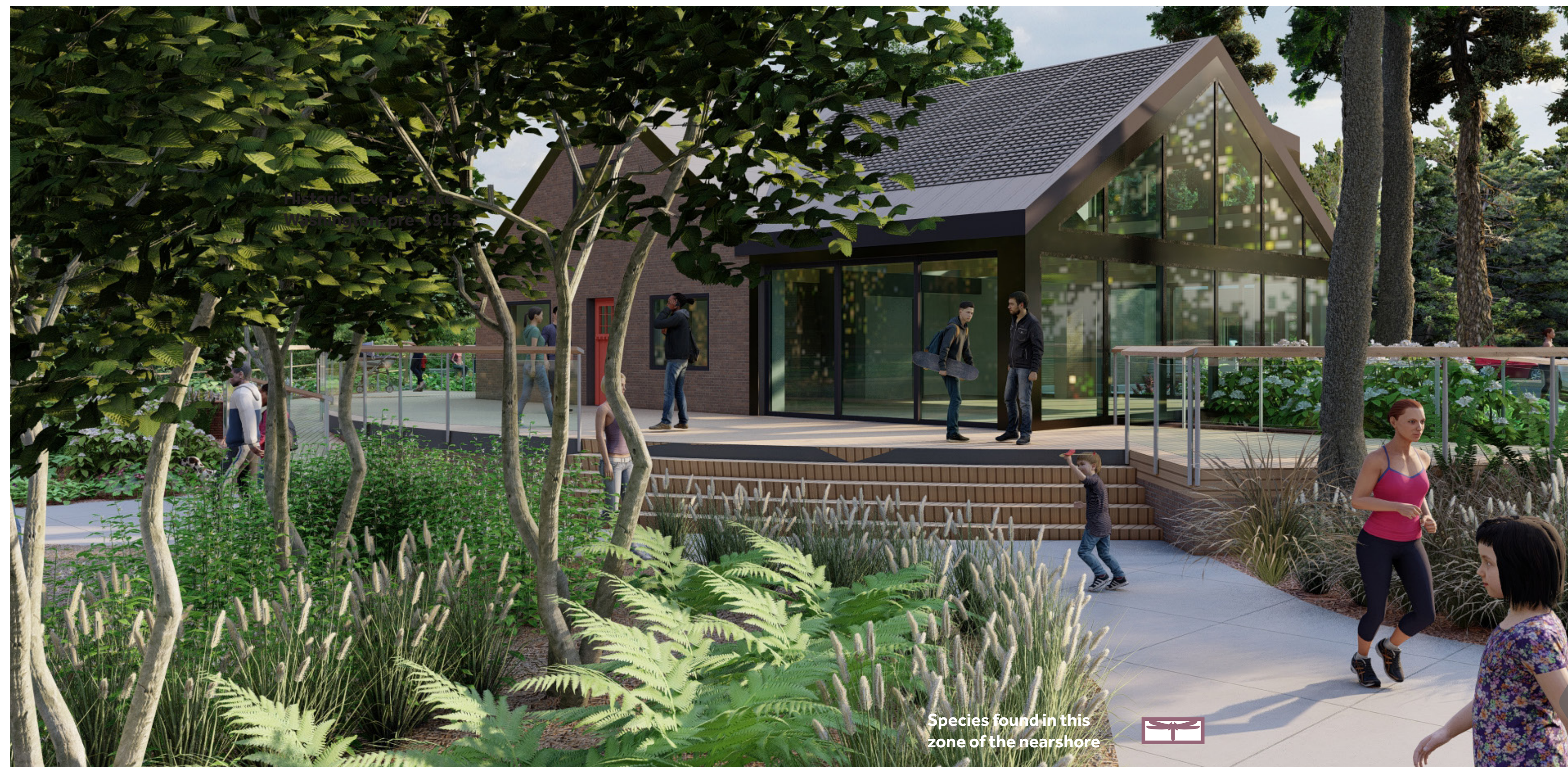
Species found in this zone of the nearshore

The Great Blue Heron, North America's largest heron, is known for its stillness, patience, and striking hunting skills. Wading slowly through shallow water, it catches fish and other small prey with remarkable speed. In flight, its neck folds into a distinctive S-shape as it glides on broad wings. For many Indigenous peoples, the heron symbolizes wisdom, patience, and a strong connection to water and place. Its presence reflects the health and balance of wetland ecosystems.