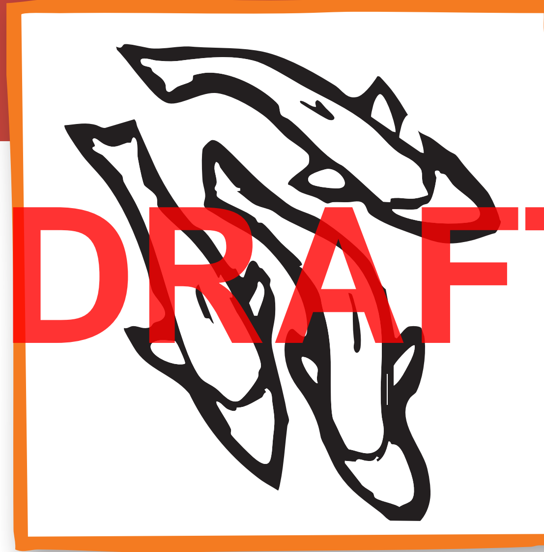
Kokanee Salmon Oncorhynchus nerka

Ulloriam rem nus consequam et et la voluptinur? Accum es etur sunt. Umquam quiscimaiost fugiatur ad magnien tusdae vel magnatem suntis volor atibus, cus, cor asi quas remo. Ad minim veniam, quis nostrud exercitation ullamco laboris nisi ut aliquip ex ea commodo consequat. Cillam eos adis voles eos errorem quia volupta tquam q ra vit esciasm nonseri.