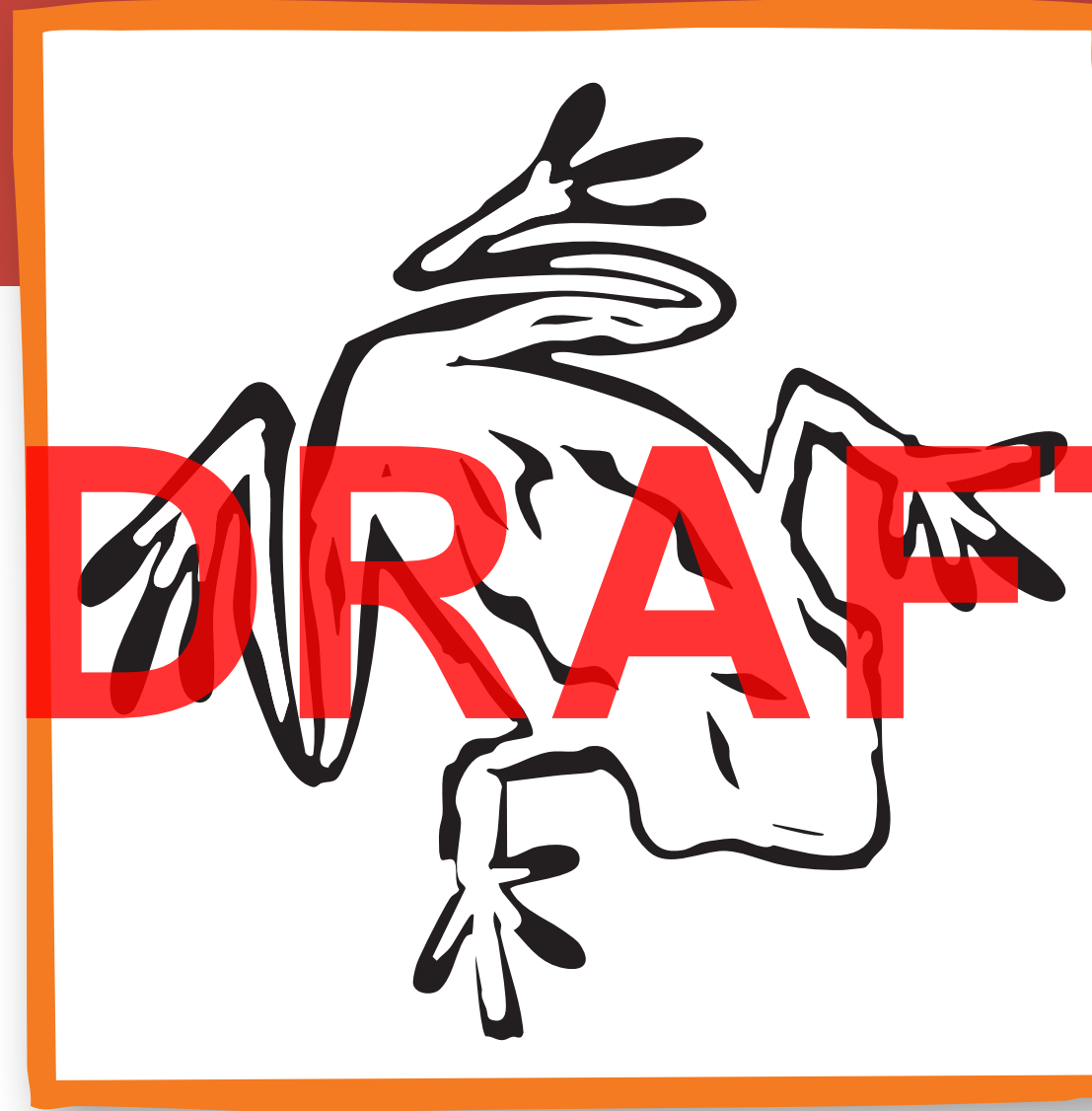
Pacific Tree Frog Pseudacris regilla

The Great Blue Heron, North America's largest heron, is known for its stillness, patience, and striking hunting skills. Wading slowly through shallow water, it catches fish and other small prey with remarkable speed. In flight, its neck folds into a distinctive S-shape as it glides on broad wings. For many Indigenous peoples, the heron symbolizes wisdom, patience, and a strong connection to water and place. Its presence reflects the health and balance of wetland ecosystems.