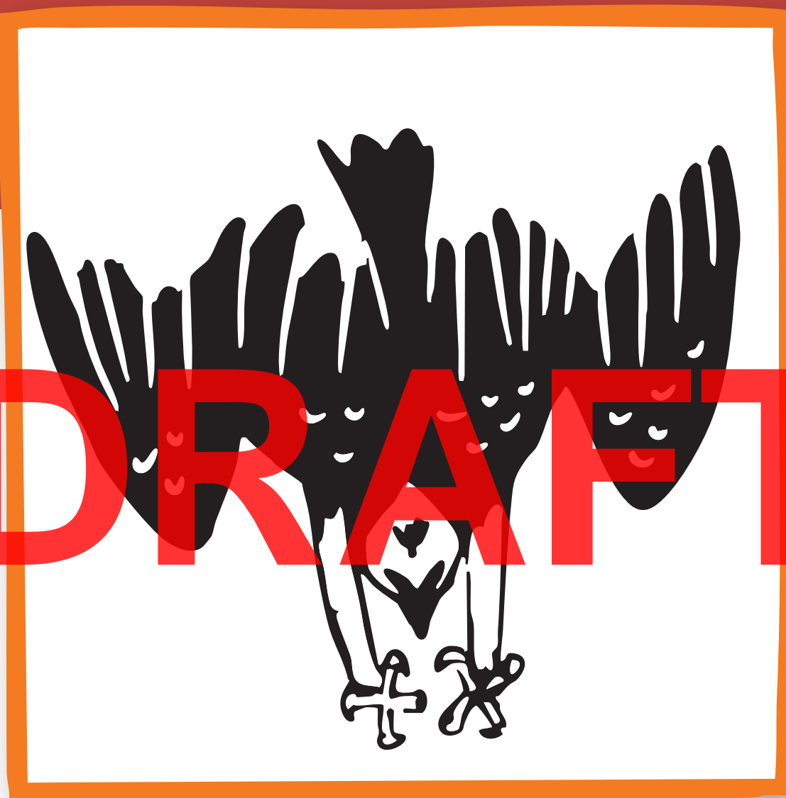
Osprey Pandion haliaetus

Lorem ipsum dolor sit amet, consectetur adipiscing elit. Sed do eiusmod tempor incididunt ut labore et dolore magna aliqua. Ut enim ad minim veniam, quis nostrud exercitation ullamco laboris nisi ut aliquip ex ea commodo consequat. Duis aute irure dolor in reprehenderit in voluptate velit esse cillum dolore eu fugiat nulla pariatur. Excepteur sint occaecat cupidatat non proident, sunt in culpa qui officia deserunt mollit anim id est laborum.