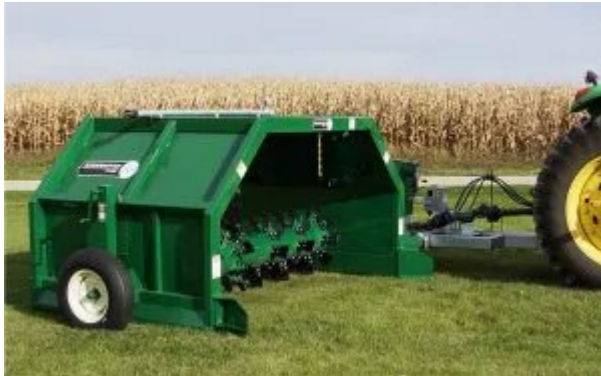
▲ Aeromaster PT-120