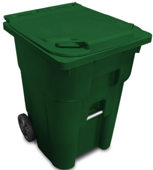
▲ 95 Gallon Container