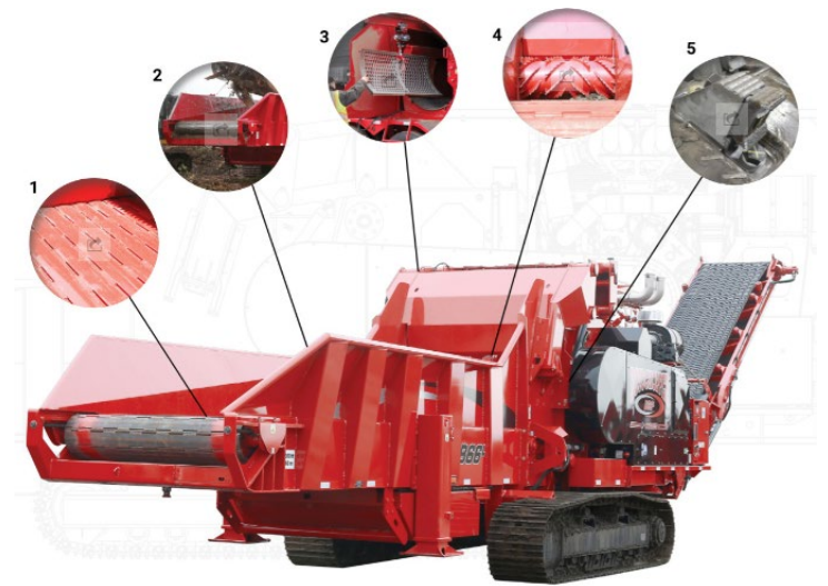
▲ RotoChopper B-66L