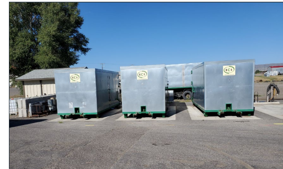
▲ In-Vessel Composting