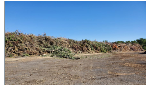
▲ Wood Waste Pile