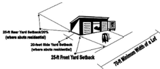
Figure 12 (B-3 Commercial)

(1972 Code, sec. 30.621; 2008 Code, sec. 14.02.322)