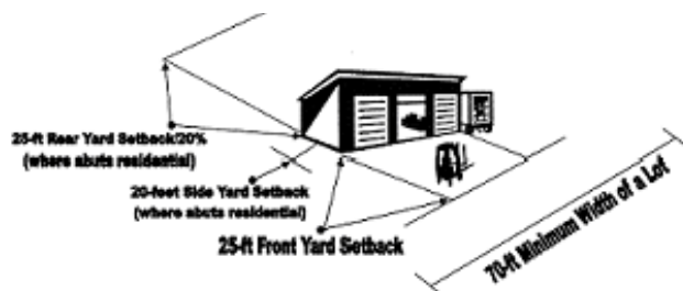
Figure 13 (I-1 Industrial)

(1972 Code, sec. 30.622; 2008 Code, sec. 14.02.323)