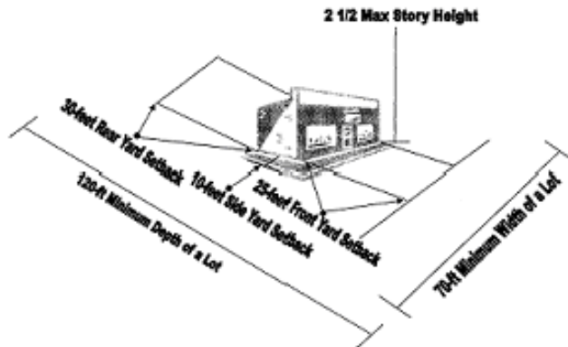
Figure 10 (B-1 Small Business)

(1972 Code, sec. 30.619; 2008 Code, sec. 14.02.320)