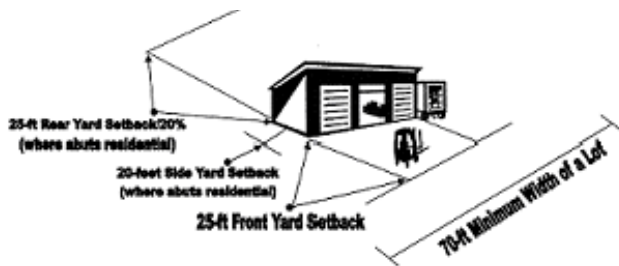
Figure 13 (I-1 Industrial)

(1972 Code, sec. 30.622; 2008 Code, sec. 14.02.323)