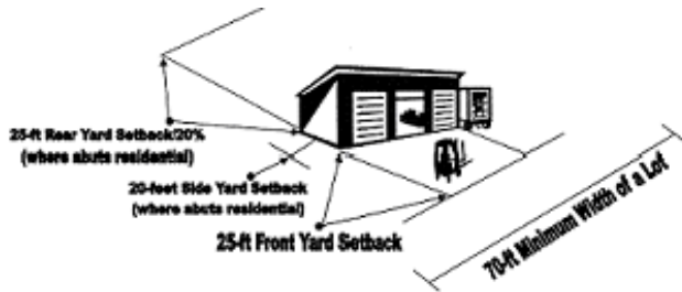
Figure 12 (B-3 Commercial)

(1972 Code, sec. 30.621; 2008 Code, sec. 14.02.322)