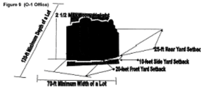
Figure 9 (O-1 Office)

(1972 Code, sec. 30.618; 2008 Code, sec. 14.02.319)