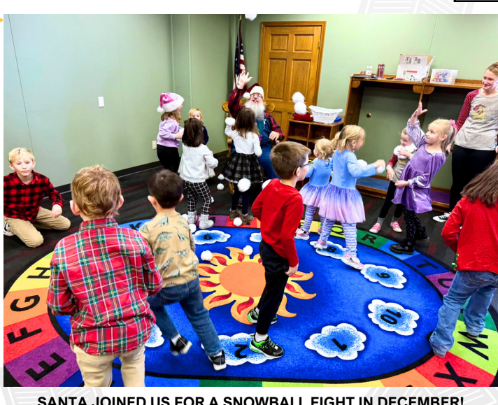
SANTA JOINED US FOR A SNOWBALL FIGHT IN DECEMBER!

SUNDAY: CLOSED MONDAY-FRIDAY: 9 AM - 6 PM SATURDAY: 11 AM - 3 PM