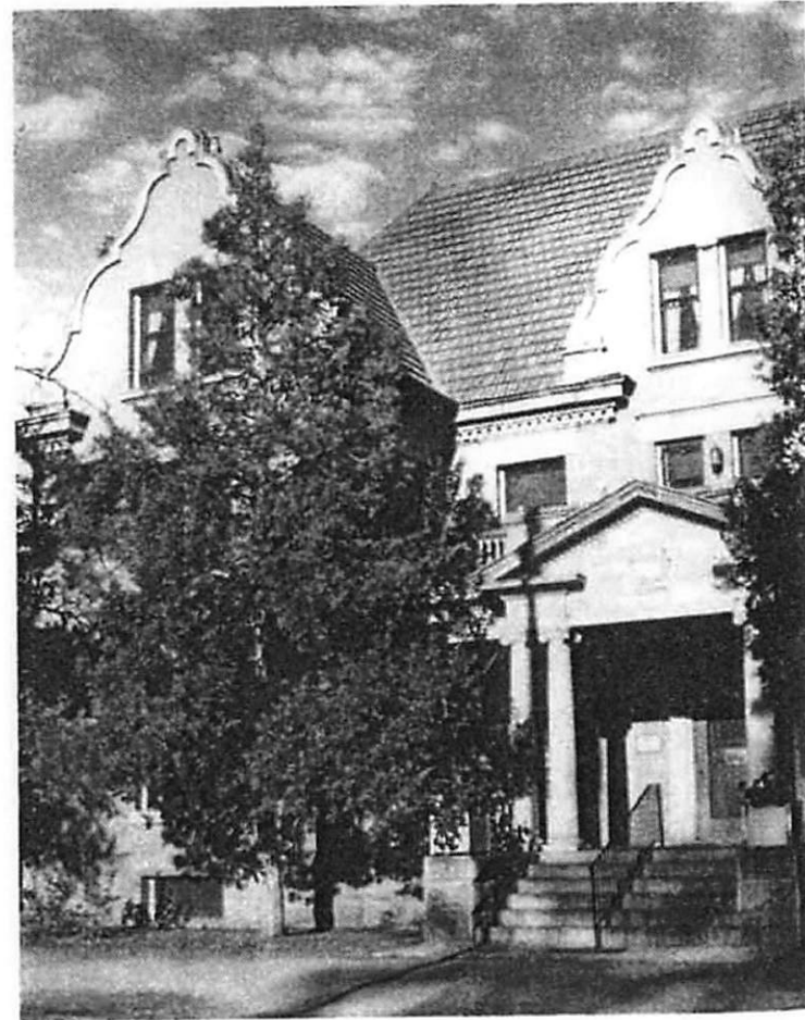
"Trail End", Mansion Home of cattleman John B. Kendrick (also Wyoming Governor and U. S. Senator) was saved when an ARBA grant of $12,000 to pay off the mortgage was given to the Sheridan County Historical Society. The Society has preserved the home as a museum.