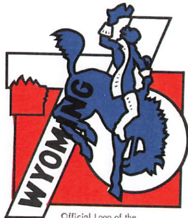
Official Logo of the Wyoming Bicentennial Commission