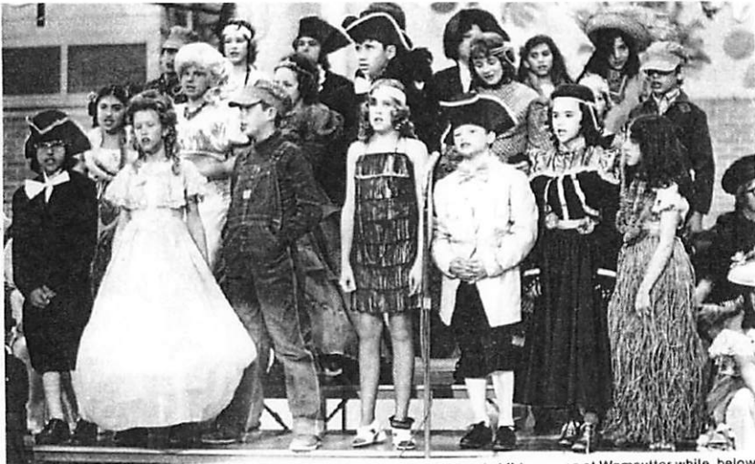
Local celebrations took precedence in Wyoming. Above, costumed school children sang at Wamsutter while, below, an old-time dance brought cowboys—and their horses—to the town hall at Lost Springs, nation's smallest Bicentennial community.