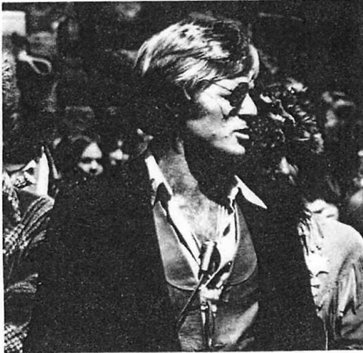
Actor Robert Redford (left) attended the re-burial of Jeremiah Johnson at Cody's Trail Town.