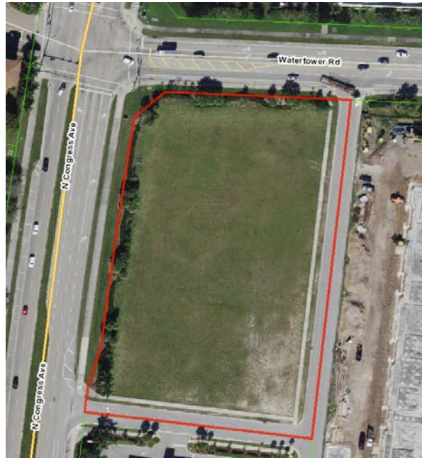
Figure 1: Aerial View of Site (image not to scale; for visual purposes only)

Owner & Applicant(s): Congress Avenue Properties LTD Agent and Consultant: Emily Bernahls, Bernahls Development Services Location: 280 N Congress Ave Net Acreage (total): 2.99 acres Legal Description: See survey enclosed in packet. Existing Zoning: C-2 Future Land Use: Commercial and Light Industrial